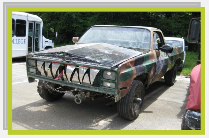
"EV" (pronounced "EE-vee"), the diesel-to-electric short haul truck. Once owned by Warren Wilson's Forestry Crew, it now serves as an auto shop crew vehicle and educational tool.