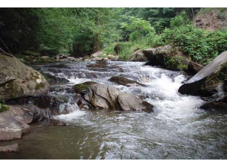
Fines Creek, Haywood County, NC