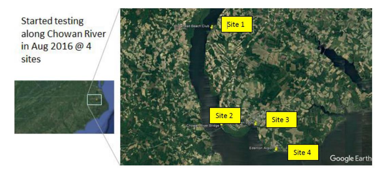
Figure 8-1 CEEG sample collection sites in the Chowan and Pasquotank River Basin