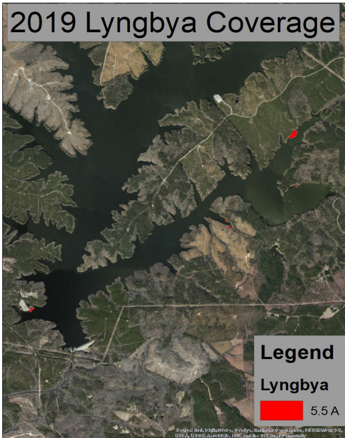
Figure 3. Map showing coverage of Lyngbya (5.5 acres).