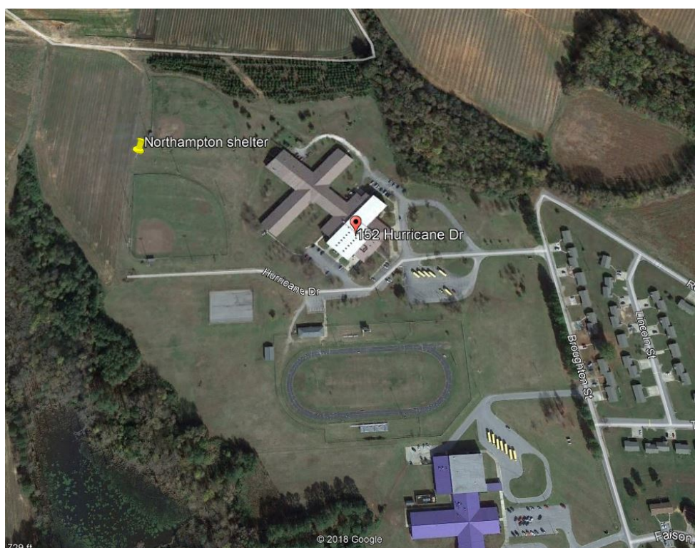
- Figure 10.1 Aerial View of the Northampton Site Location and Surrounding Areas

When selecting a site, the chief adheres to the site selection criteria specified in 40 CFR Part 58, Appendix D. The selection of a specific monitoring site includes the following activities: