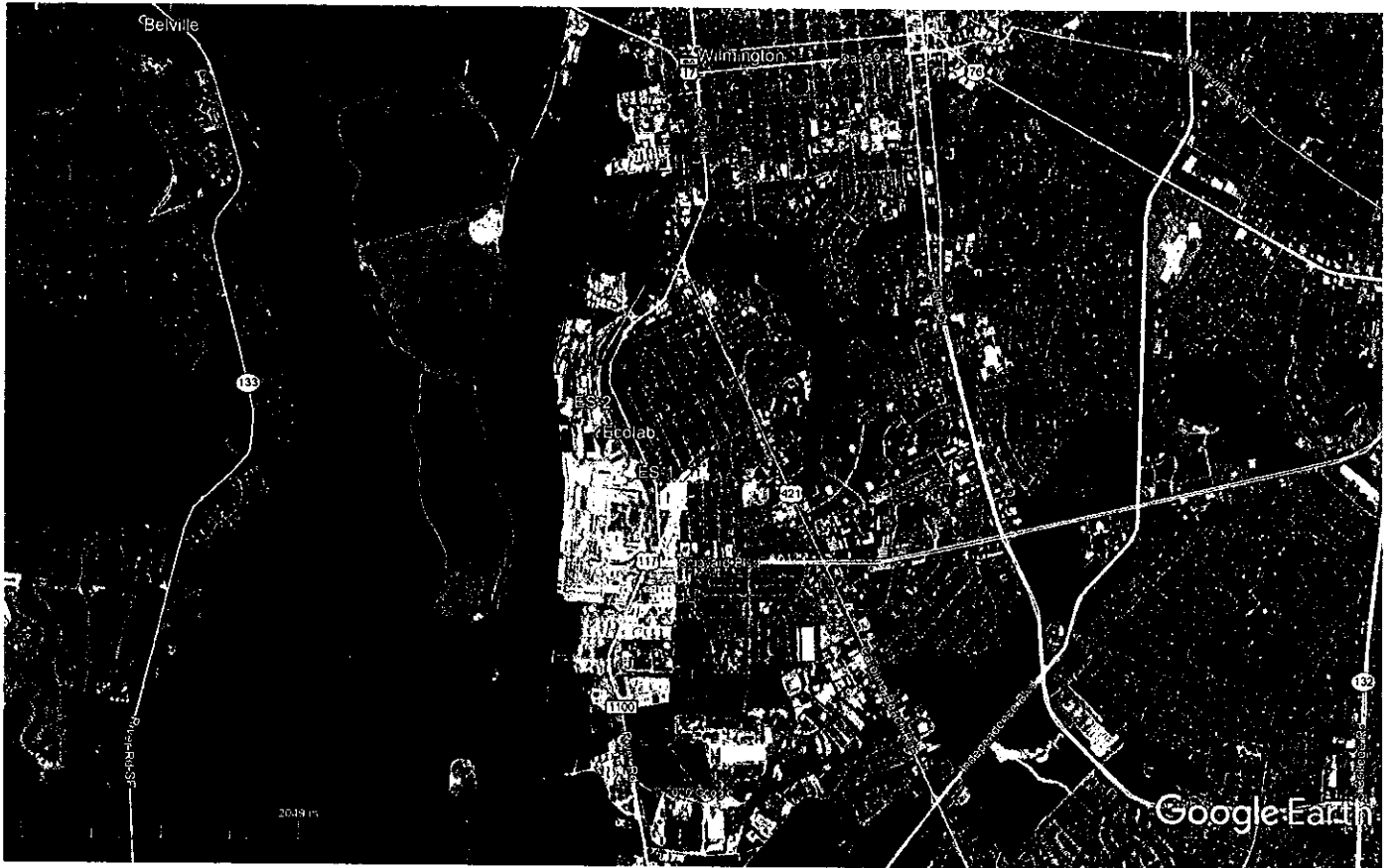
Figure 4-1. Area Map of Ecolab and Surroundings

For modeling purposes the appropriate land use classification for the area was determined as rural based on a review of topographic maps and guidance provided in the Guidelines .