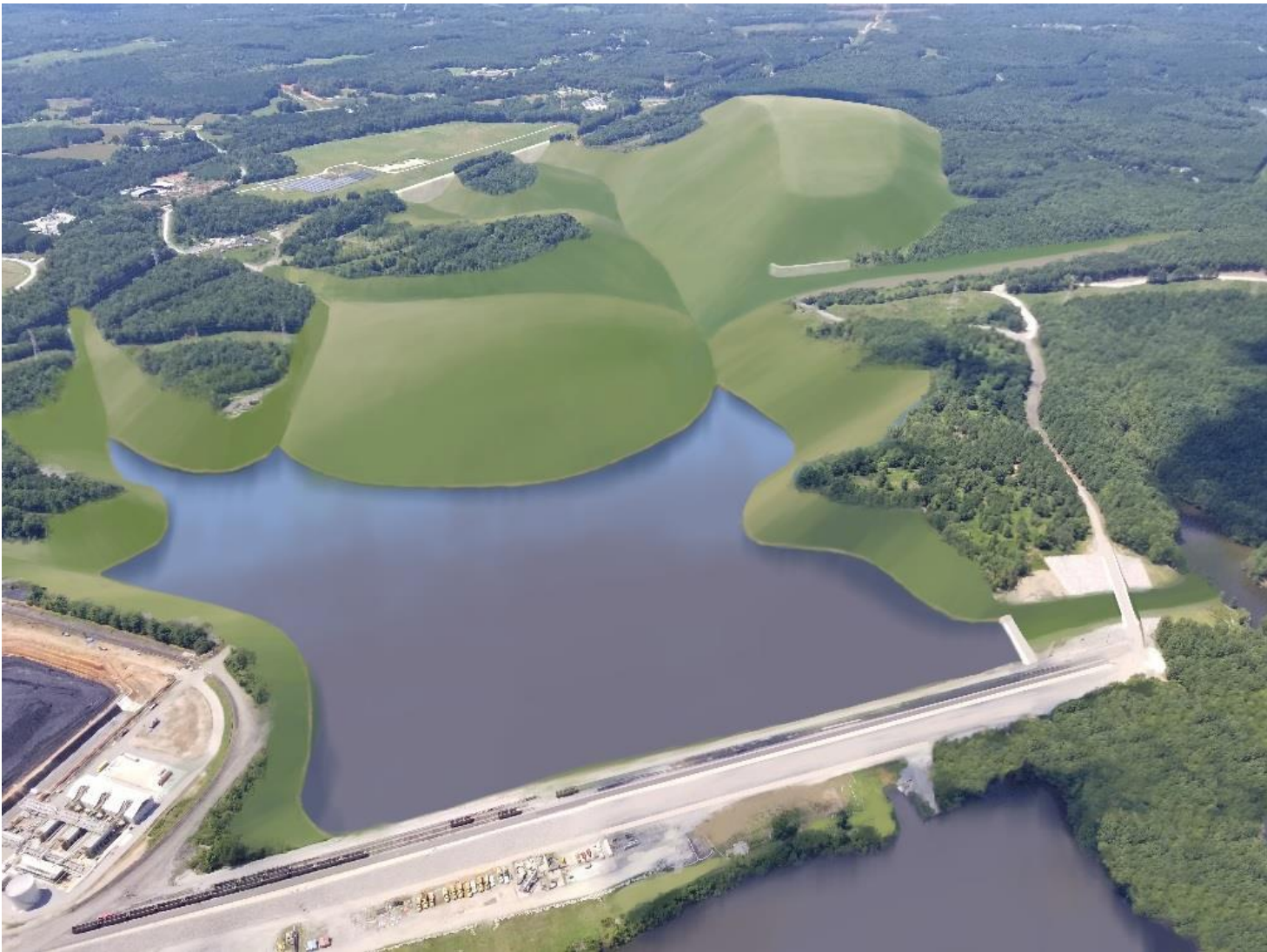
Post Closure View