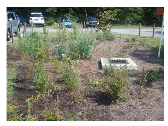
Bradley Creek Elementary BMP