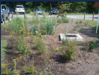
Bradley Creek Elementary BMP

A BMP can be an action, a structure, or a practice. BMPs are designed to reduce the volume of runoff and reduce the influx of non-point source pollutants.