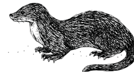
River otter ( Lontra canadensis )