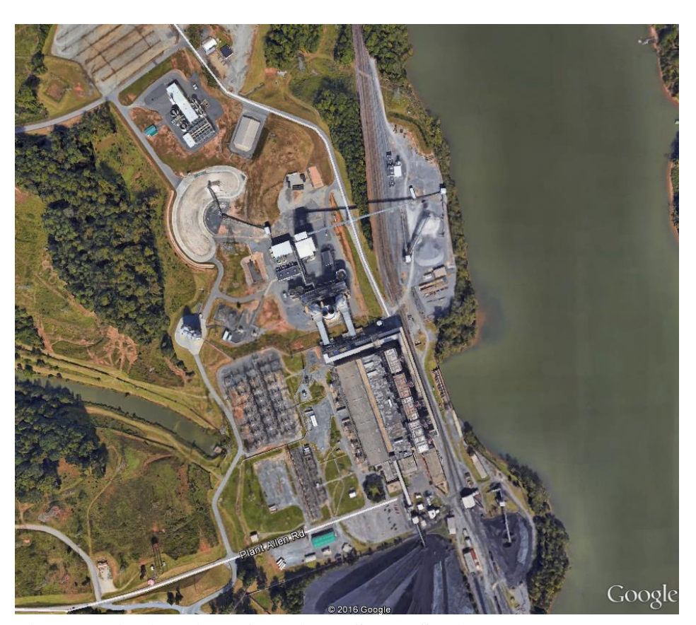
Figure 2. Aerial View of the Allen Steam Station