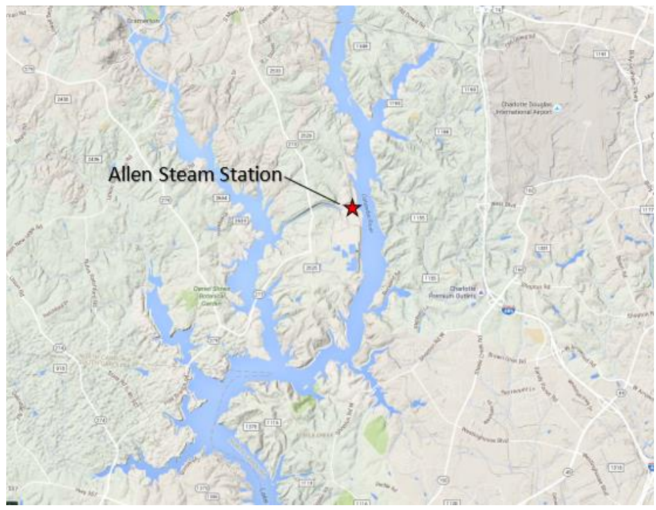
Figure 1. Location of the Duke Energy Allen Steam Station