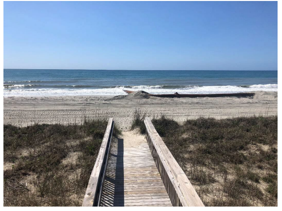
Figure 1. A typical wooden structural accessway.