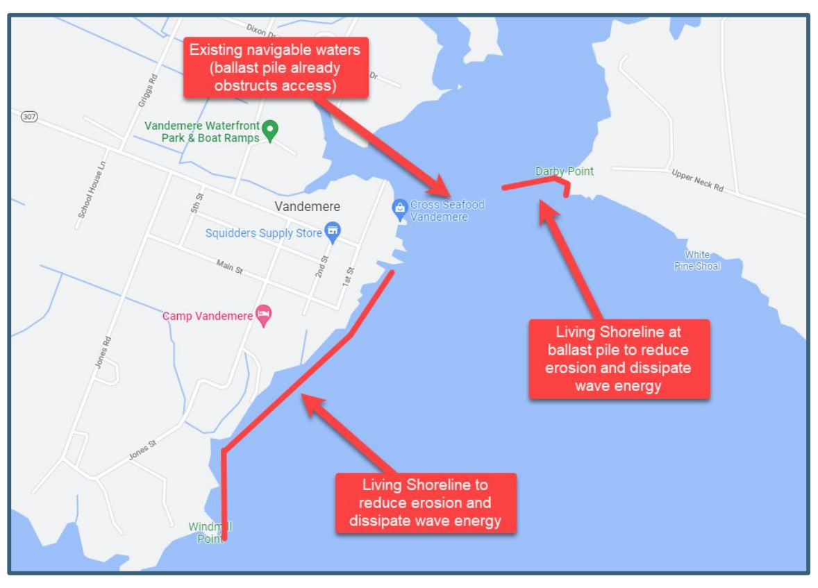
Figure 19: Vandemere Living Shoreline Locations