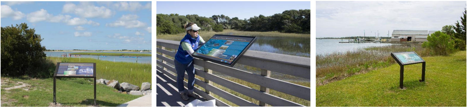
From L to R: DUML living shoreline sign, Rachel Carson Reserve living shoreline sign on boardwalk, NOAA Beaufort Lab living shoreline sign

Four living shoreline informational signs were installed near three demonstration sites in Carteret County. Two sites on Pivers Island include the marsh sill on the west end of the island at the Duke University Marine Lab (DUML) and the living shoreline on the east end of the island at the National Oceanic and Atmospheric Administration (NOAA) Beaufort Lab. The other two signs discuss the Rachel Carson Reserve demonstration site and are installed at the on-site boardwalk and at the WRC's Lennoxville Road boat ramp in Beaufort.