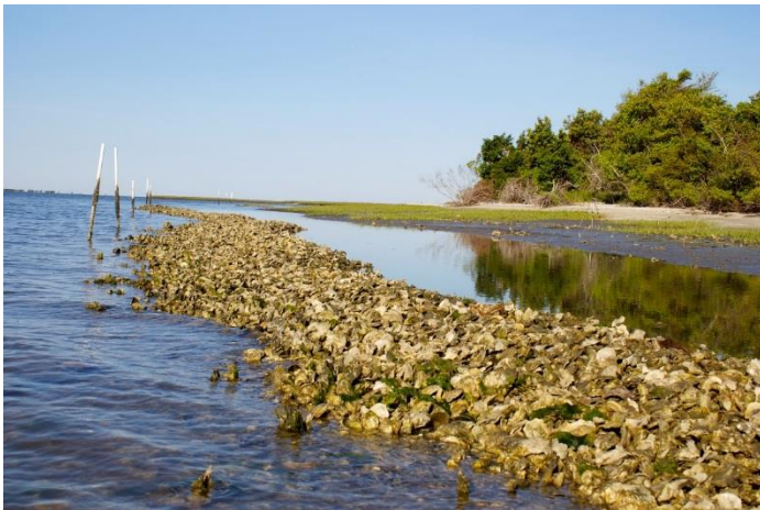
Living shoreline demonstration site at the Rachel Carson Reserve

In May 2015, the oyster sill living shoreline demonstration site at the Rachel Carson Reserve was replanted with 3,000 saltmarsh cordgrass plants with help from 17 volunteers. Reserve staff monitored survival of vegetation along permanent transects at weekly intervals for one month. The Reserve Research Coordinator is continuing to explore long-term monitoring options for the living shoreline demonstration site at the Rachel Carson Reserve.