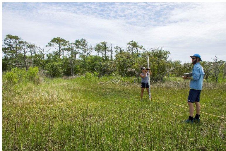
UNC IMS and Reserve researchers use a laser level to measure marsh elevation

The results will provide an evaluation of the erosion protection provided by marsh sills in comparison to bulkheads, with natural, non-stabilized marshes serving as a control. Results will be used to educate coastal residents of the resilience of different shoreline stabilization techniques to large storms.