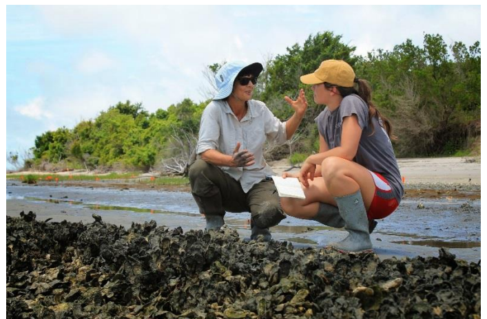
NOAA researcher informs a volunteer about living shorelines during the planting at the living shoreline demonstration site at the Rachel Carson Reserve