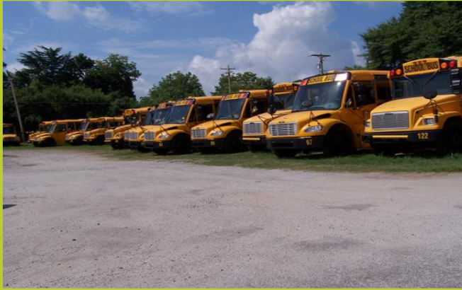
Catawba County Schools has more than 300 buses available for student transportation.