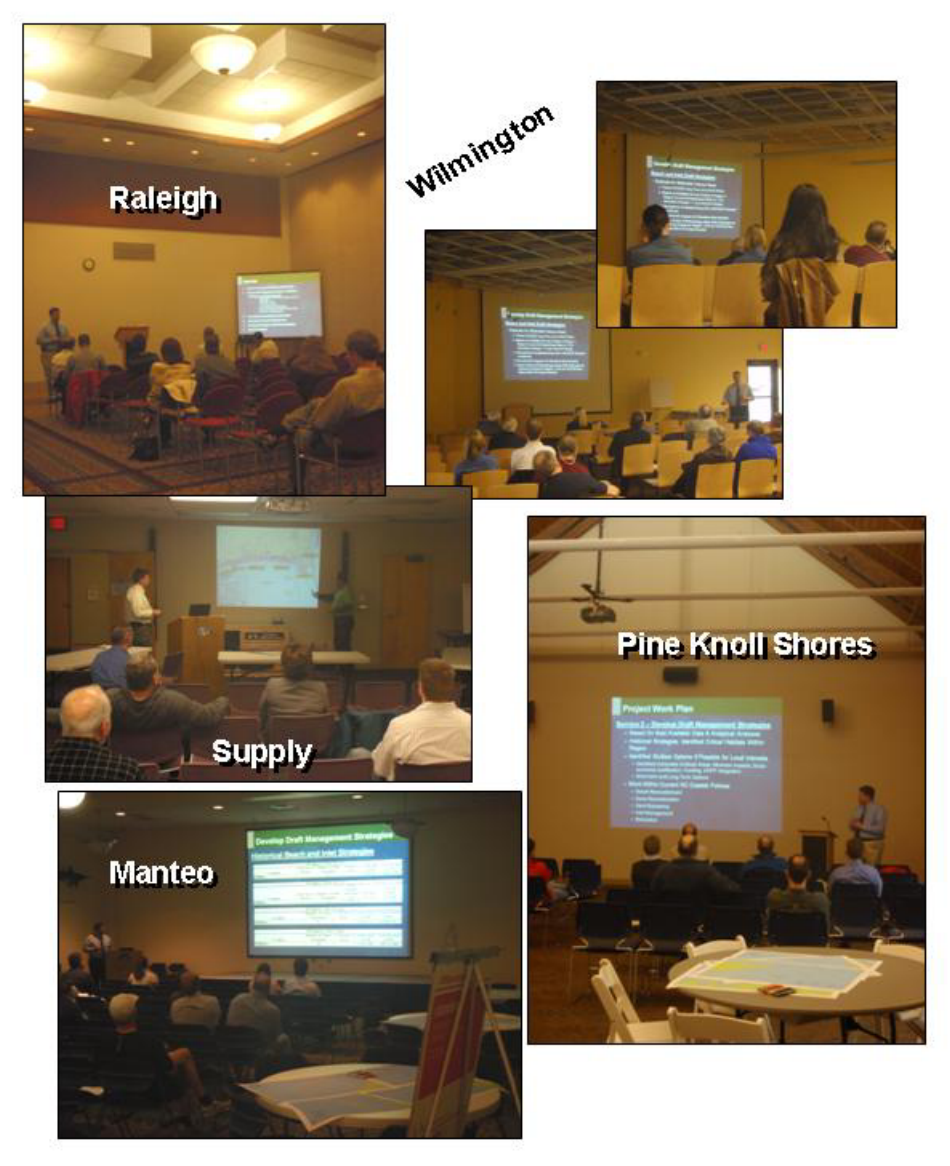
Figure VII-3. Photos Documenting Second Set of Public Meetings

Questionnaires were provided at the public meetings to help facilitate discussion and to allow the public to comment individually if desired either by submitting the questionnaire at the end of the meeting or by email at a later date. Examples of the questionnaires, the BIMP Information Sheet, and public comments received are provided in Appendix G.