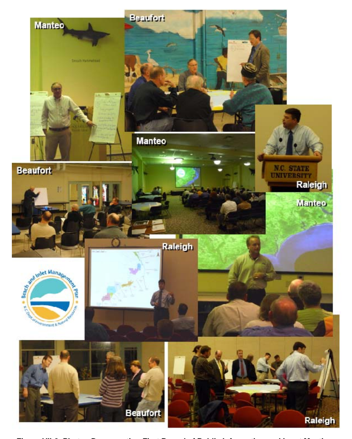
Figure VII-2. Photos Documenting First Round of Public Information and Input Meetings