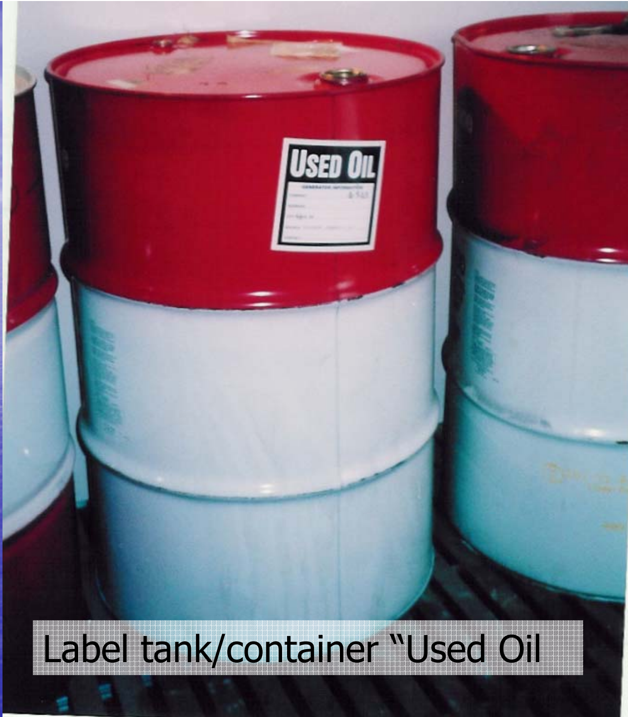
Label tank/container "Used Oil"