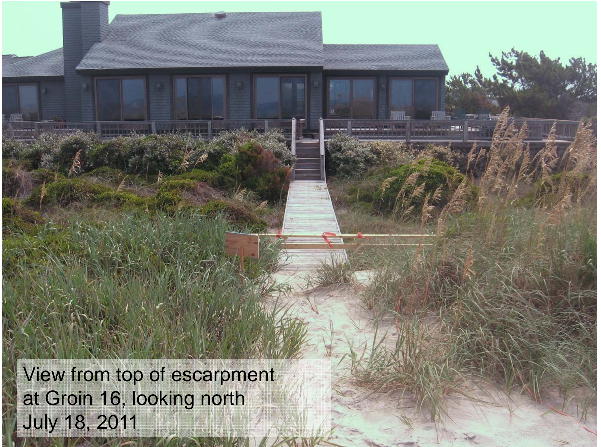
View from top of escarpment at Groin 16, looking north July 18, 2011