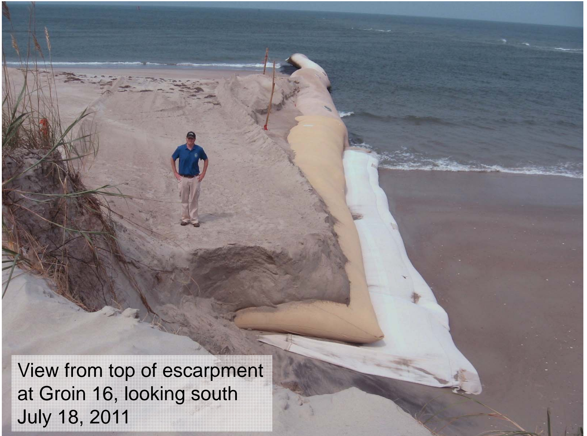
View from top of escarpment at Groin 16, looking south July 18, 2011