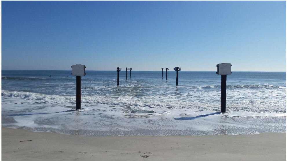
Fig. 3 Outfall buried and extended beyond the surf zone, and marked with warning signs

The CRC was also asked to allow for as-needed lengthening and shortening of existing outfall pipes, and routine maintenance and repairs due to exposure or storm damage.