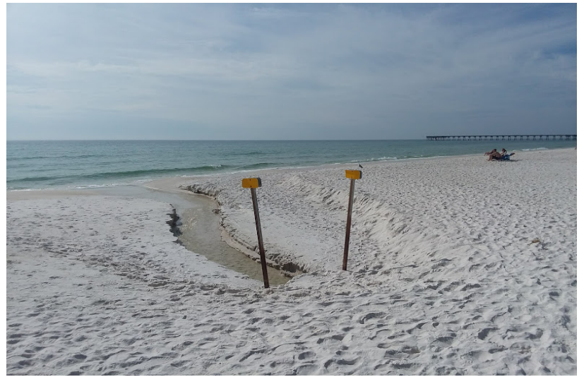
Fig. 1 Non-extended outfall on a nourished beach

In other cases, particularly in New Hanover County, outfall pipes and framing may become exposed as the beach erodes, Fig. 2, creating an impediment to pedestrian and vehicular access. In these cases, the responsible government may wish to temporarily shorten the length of the pipe to allow lateral access.