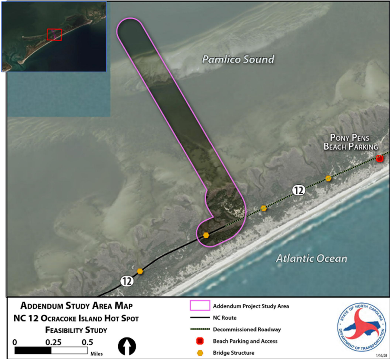
Figure 1. Project Study Area