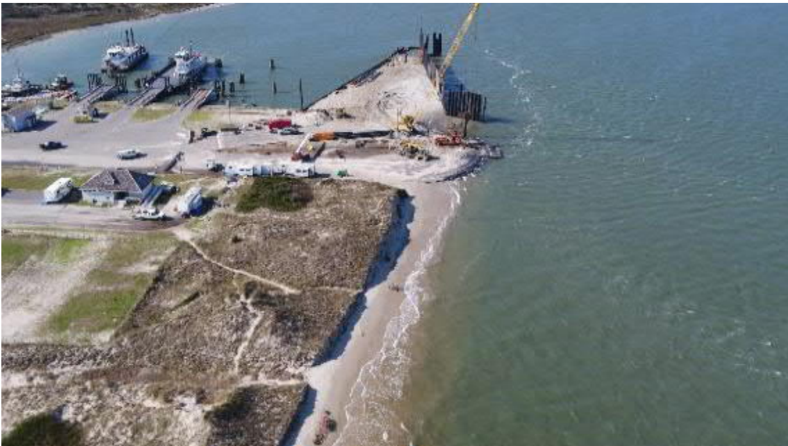
Photos of South Dock Erosion

Alternative 7 is intended to maintain the operational integrity of NC 12 and the South Dock ferry terminal on Ocracoke Island after a major storm or event. This goal will be met by reducing the road pavement length of NC 12 on Ocracoke Island, and placing the ferry terminals closer to each other, therefore reducing potential areas where roadways are compromised by severe weather conditions. The alternatives described in the