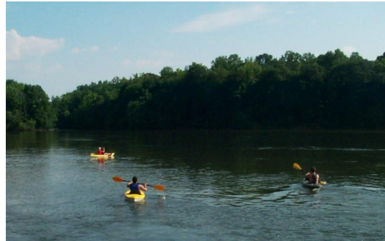
Kayakers on the Catawba River below Fort Mill, S.C.