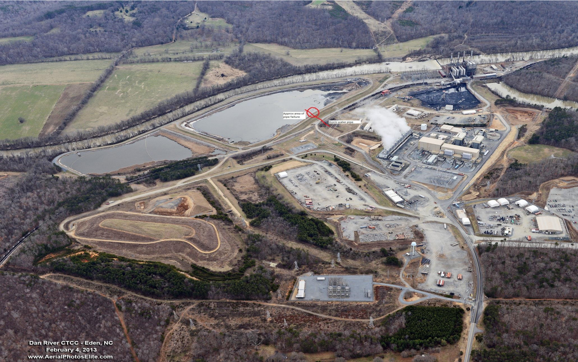
Dan River CTCC - Eden, NC February 4, 2013