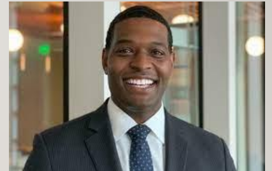
EPA Administrator, Michael S. Regan

“Bottom line is, go forth and do; don’t wait.”