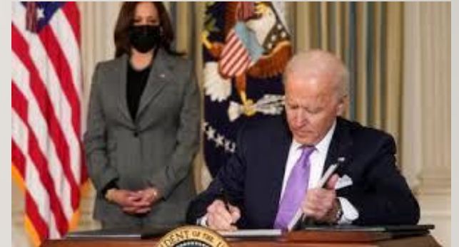
U.S. President and Vice President, Joseph R. Biden, Jr. and Kamala D. Harris