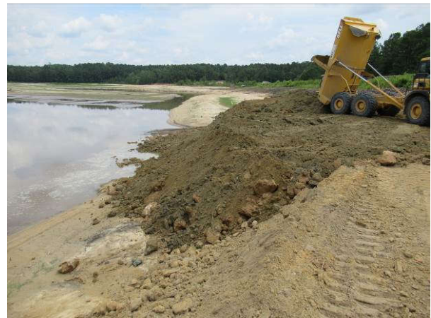
Cofferdam used as additional stockpile area