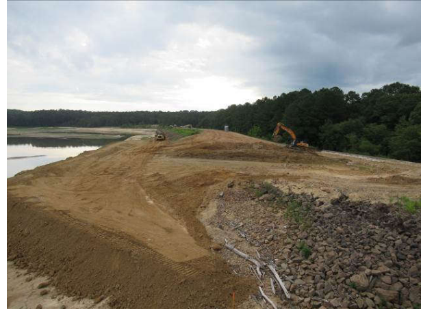
View of spillway at beginning of week