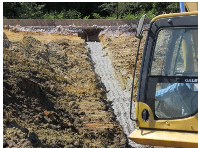
Trench filled with bedding stone