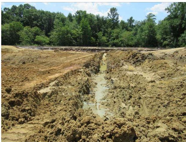
View of the completed dewatering trench