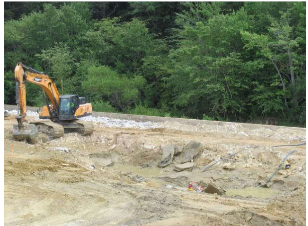
View of the dewatered failure hole