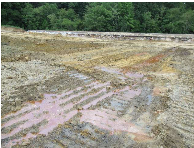
View of the cofferdam from a sandbar