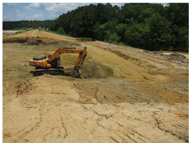
Failure hole has been entirely filled in