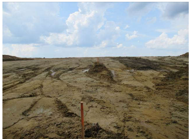
Water beginning to seep out of spillway