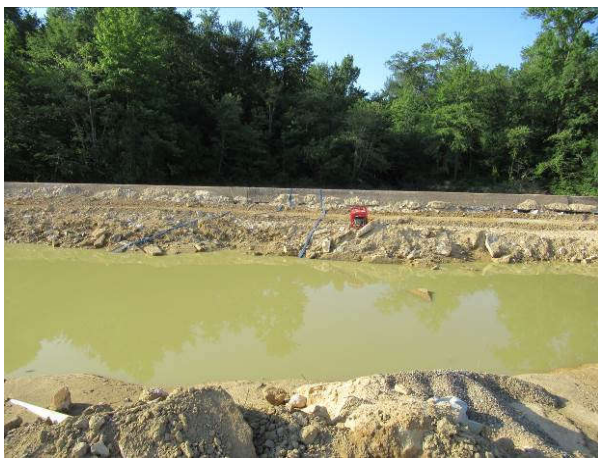
View of the failure hole being dewatered