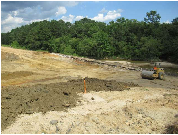
Spillway sides being filled and compacted