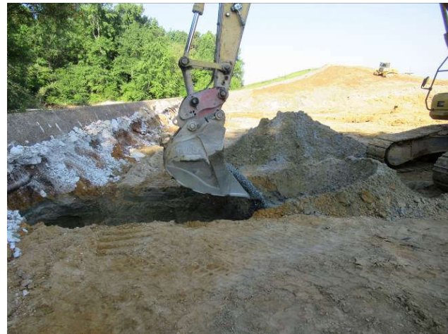
Began of construction of a second trench