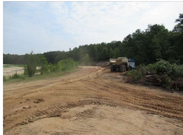
Additional area cleared at the staging area