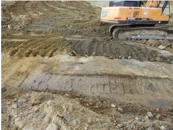
Water beginning to show on spillway