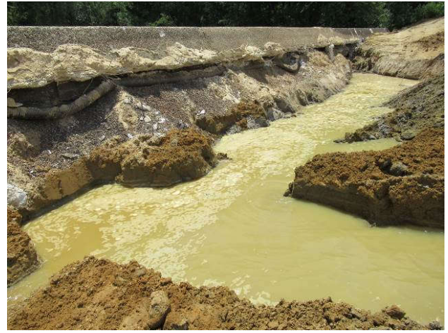
The dewatering trench filled up