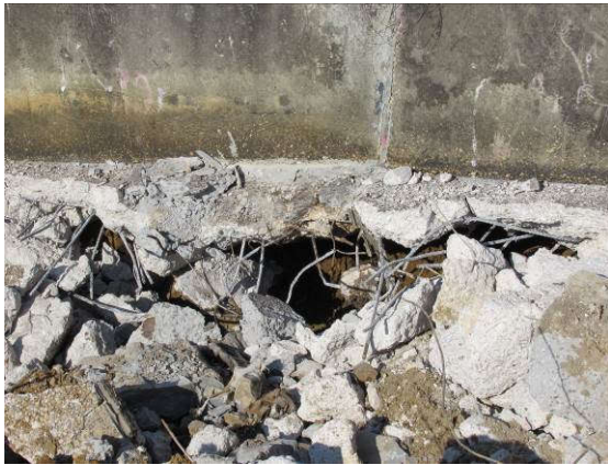
Exposed void in the side wall of the spillway