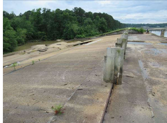
View of spillway prior to demolition