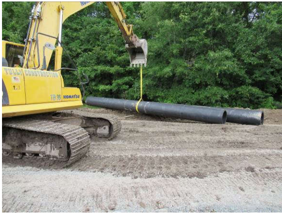
Replacement pipes for use in forest road