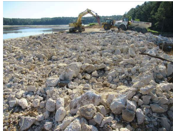
Concrete rubble left after demolition