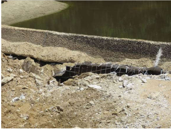
Exposed void in the lower slab of the spillway