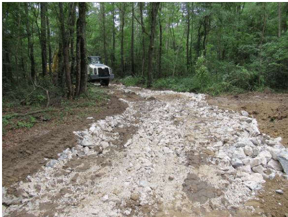
Forest road improved with concrete rubble