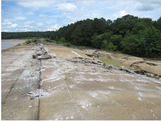
Spillway gate support columns removed