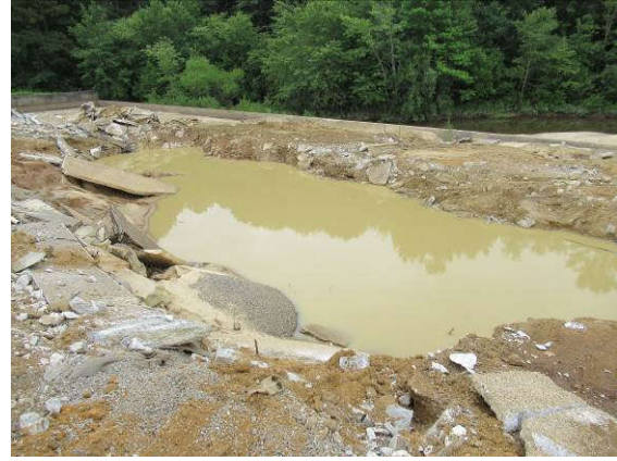
View of the hole left by the failure of the spillway