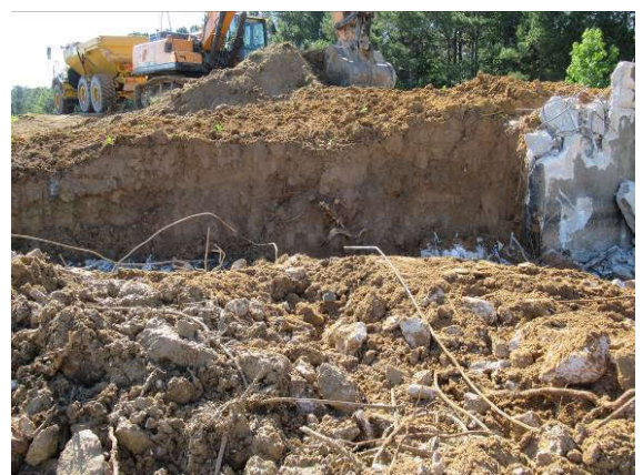
Demolished section of the spillway wall