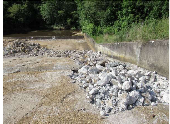
Concrete rubble ready for removal