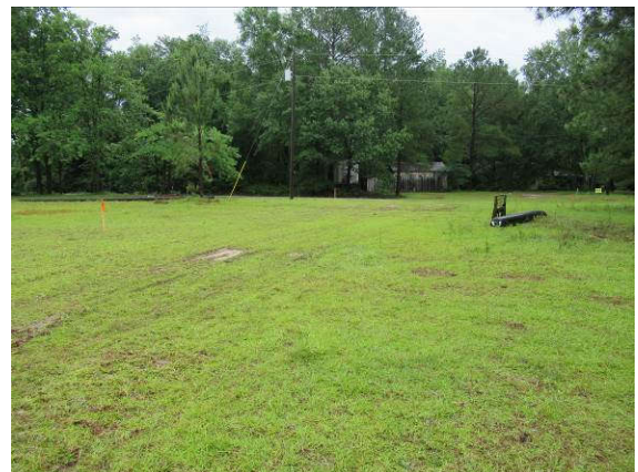
View of construction entrance area