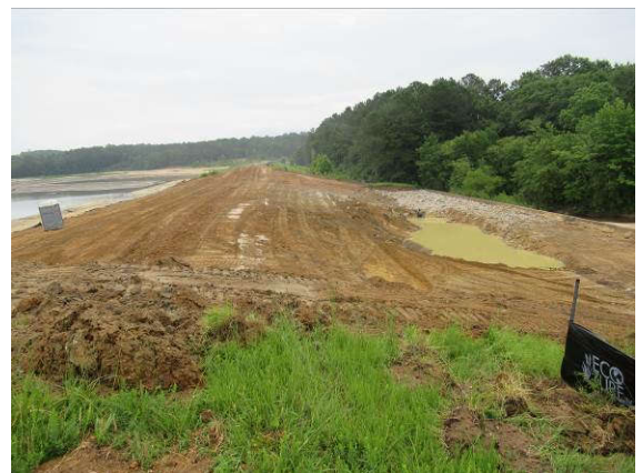
Concrete rubble removed from spillway