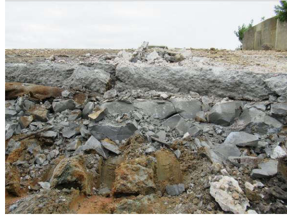
View of an exposed section of the spillway