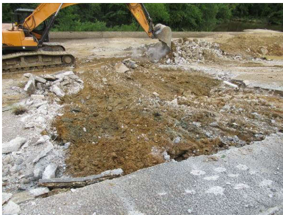
Concrete being removed from the spillway