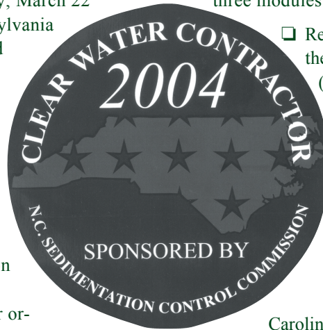
Clear Water Contractor logo given to workshop participants

The Clear Water Contractor training program targets businesses involved in land-disturbing activities, such as grading contractors and other earthmovers to make them aware of erosion and sedimentation control measures and regulations. The workshops are designed to be small with