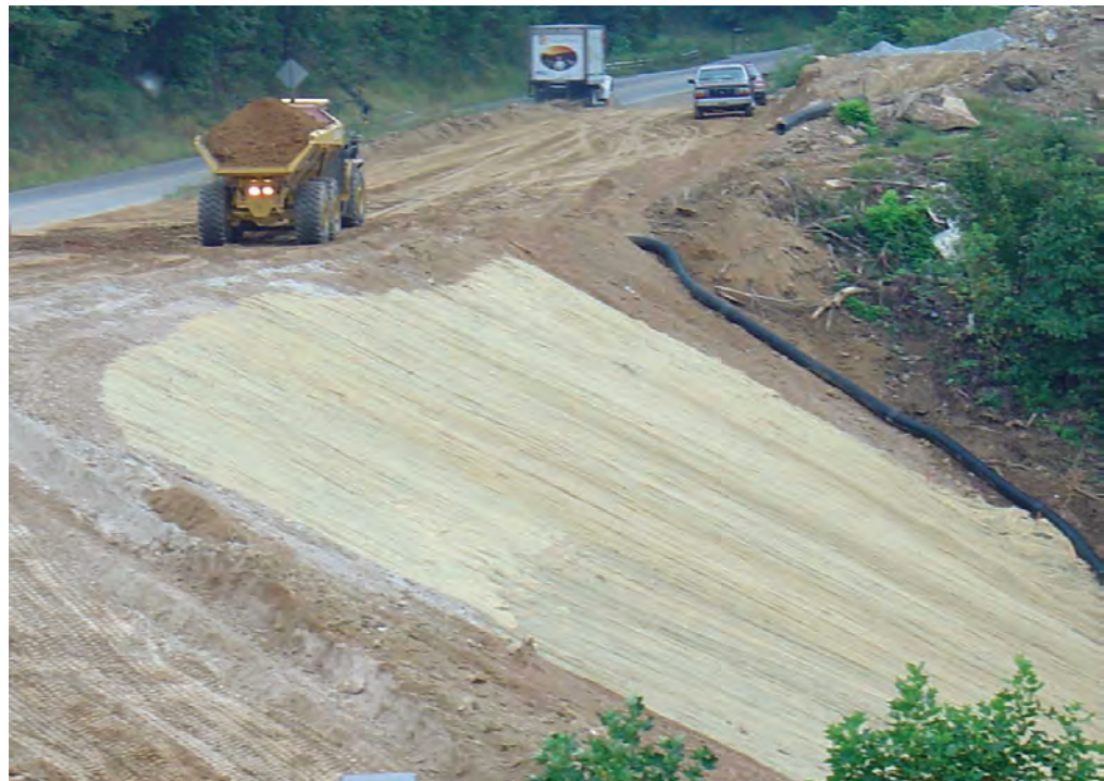
Rolled erosion control products hold seeds and mulch in place until vegetation is able to establish on steep slopes or channels.

Installation is critical to the effectiveness of these products. When close ground contact is not properly achieved, runoff can concentrate under the product, causing significant erosion. Monitor the products on a regular basis to avoid significant problems caused by rainfall.