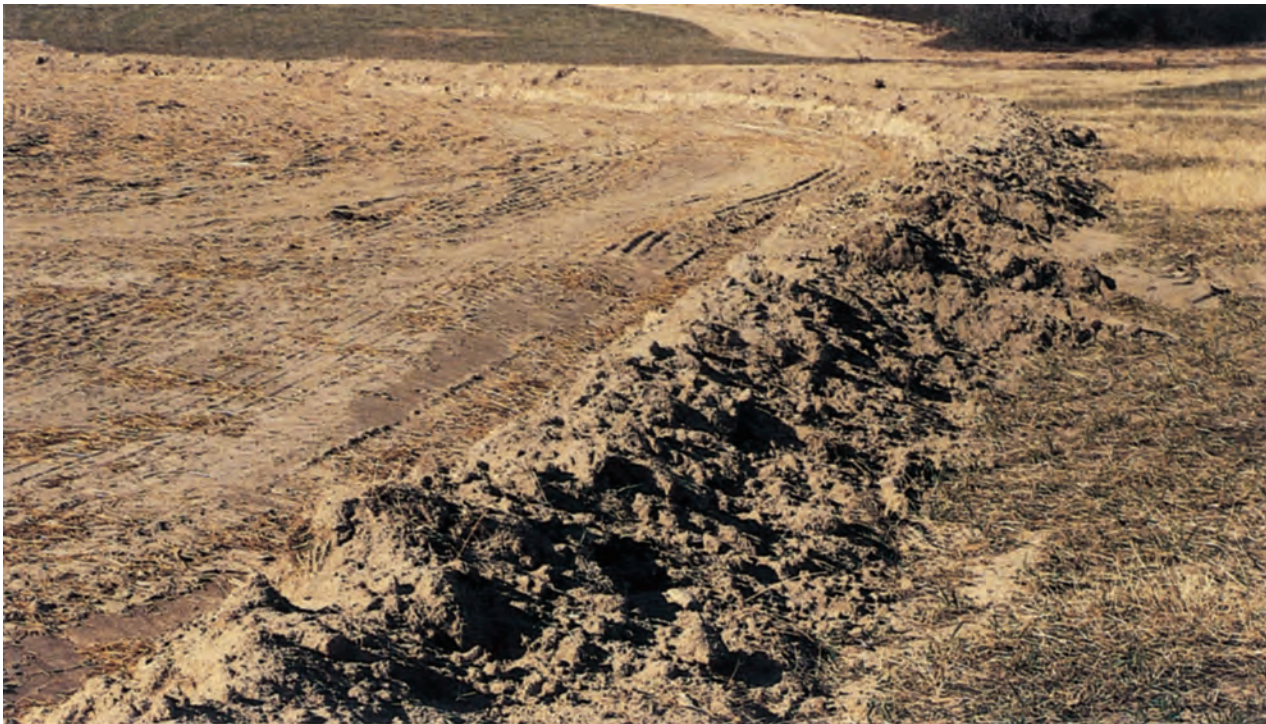
Temporary diversion across a slope helps prevent sheet and rill erosion.

Temporary diversions are usually constructed by excavating a channel and using the spoil to form a ridge or dike on the downhill side. It is important that diversions be designed, constructed, and maintained properly since they concentrate flow and increase erosion potential if failure occurs. Outlets for diversions must be stable for the expected flow and reinforced before the diversion is installed.