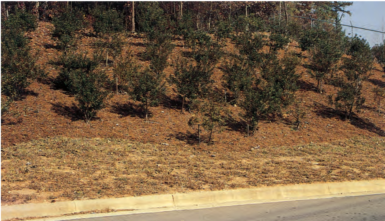
Trees, shrubs, vines and ground covers , in combination with a suitable mulch, beautify and provide long-term protection to sloping areas.

There are many different species of plants from which to choose, but care must be taken in their selection. It is essential to select planting material suited to both the intended use and specific site characteristics. None of these plants, however, is capable of providing the rapid cover possible by using grass and legumes. Vegetative plans must include close-growing plants or an adequate mulch with all plantings of trees, shrubs, vines, and ground covers.