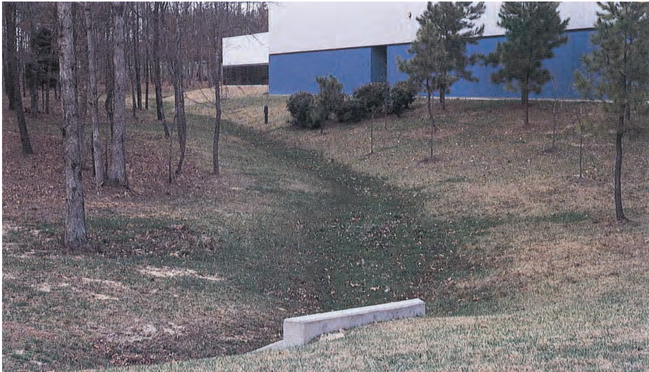
Grass-lined channels are preferred where flow velocities are within permissible limits.

The channel cross section should be wide and shallow with relatively flat side slopes so surface water can enter over the vegetated banks without erosion. Riprap may be needed to protect the channel banks at the intersections where flow velocities approach allowable limits and turbulence may occur.