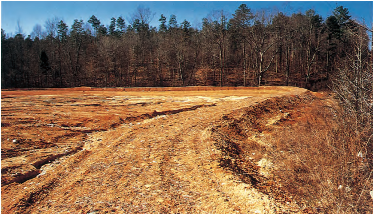
Diversion dike protects work areas and prevents sediment from leaving the site.

Frequent maintenance inspection and immediate damage repair is of prime importance.