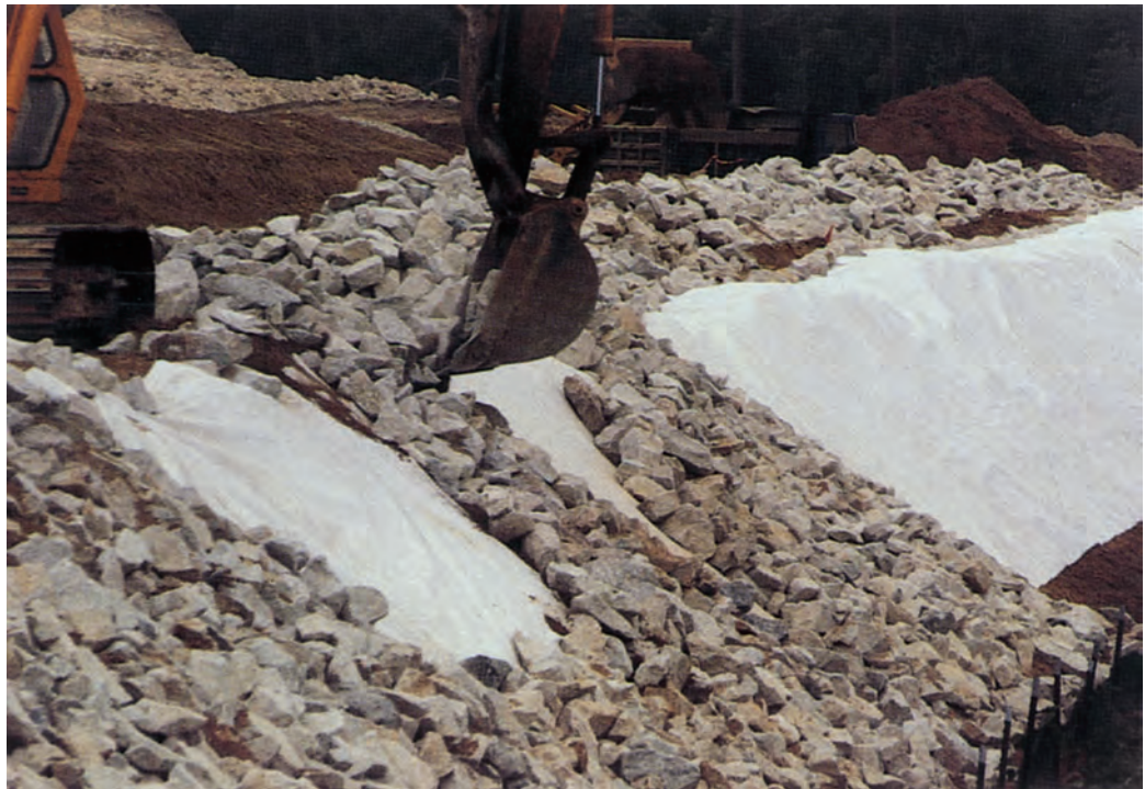
Riprap can be used to line slopes or channels to prevent erosion.

Well-graded riprap forms a dense, flexible, seal-healing cover that will adapt well to uneven surfaces. Care must be exercised in the design so that stones are of good quality, sized correctly, and placed to proper thickness. Riprap should be placed on a proper filter material of sand, gravel, or fabric to prevent soil "piping."