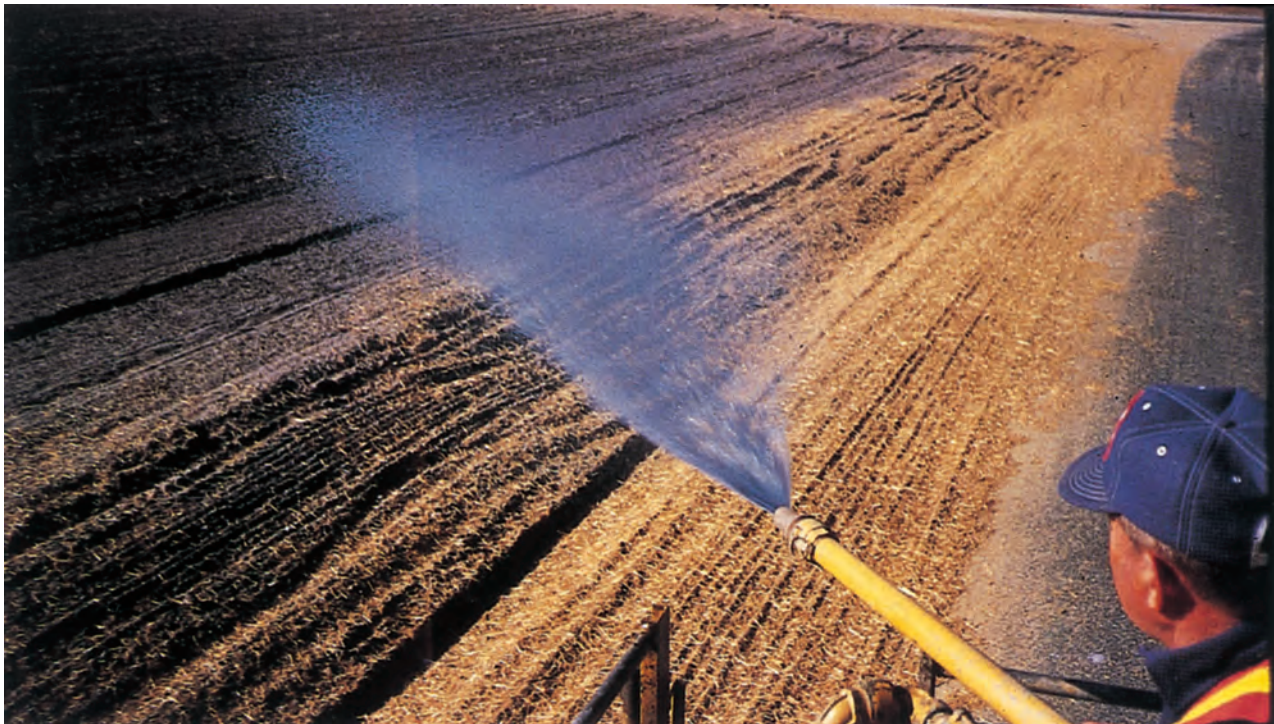
Mulch must be held in place—especially on slopes (source: NC DOT).

Mechanical mulches, such as gravel, are used in critical areas where conditions preclude the use of vegetation for permanent stabilization.