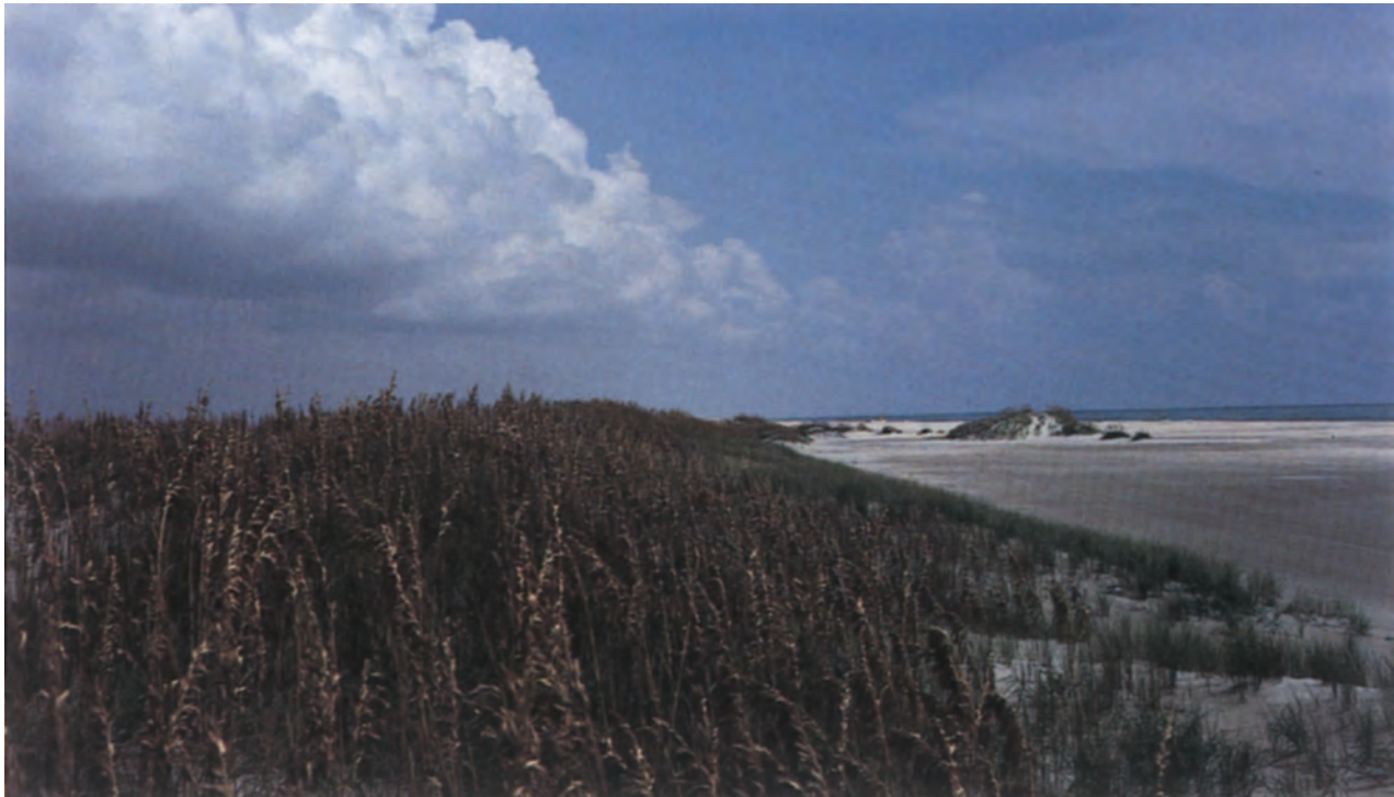
Dune stabilization with appropriate vegetation impedes sand migration, and helps maintain a buffer against wave overwash.

Sand fences accelerate sand accumulation and can be used in combination with vegetation to rebuild frontal dunes. Dune grasses grow upward through accumulating sand to hold it as the dune grows.