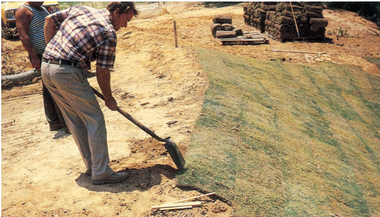
Sodding is an effective way to immediately stabilize a critical area.

Choosing the appropriate type of sod for site conditions and intended use is of utmost importance.