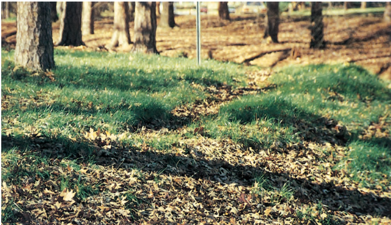
Level spreader releases flow from a diversion onto a uniform stable area.

Construct level spreaders in undisturbed soil. The lip must be level to ensure uniform spreading of storm runoff, and the outlet slope uniform to prevent the flow from concentrating. Water containing high sediment loads should enter a sediment trap before release in a level spreader.