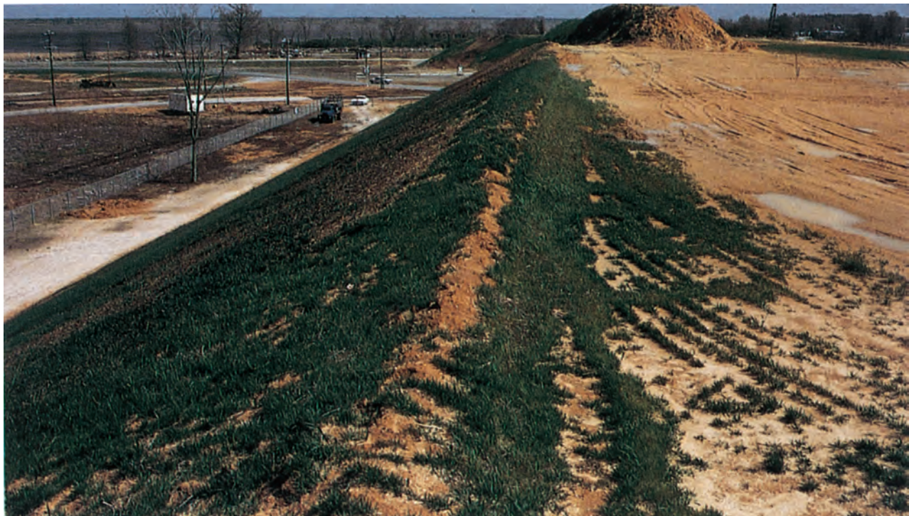
Permanent diversion controls the direction and velocity of runoff for erosion control and flood protection.

Functional need, velocity control outlet stability, site aesthetics, and maintenance requirements are key considerations in the planning and design of permanent diversions.