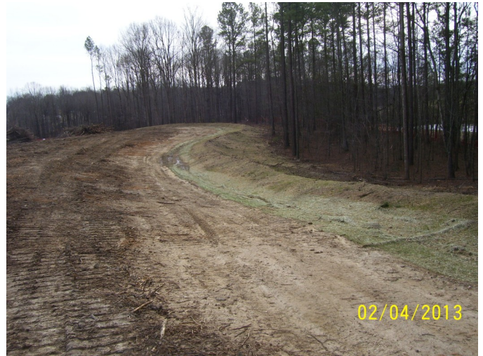
Temporary diversion ditches have been installed with matting. Seed is starting to come up in some places.