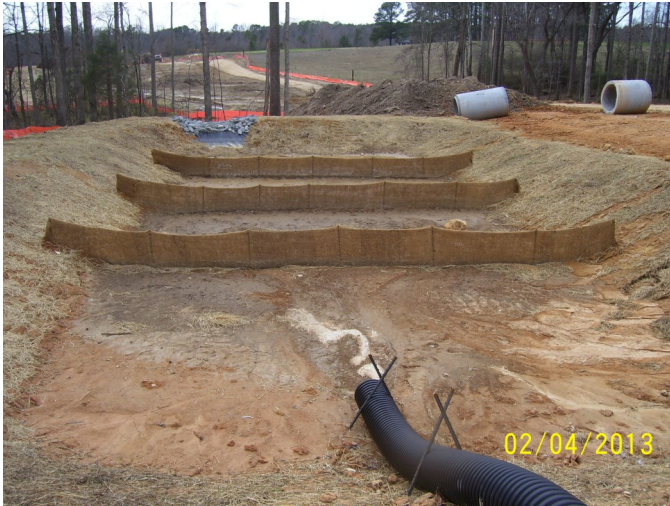
Temporary basin "C" is installed with slope drain, baffles and skimmer. Basin has been seeded and mulched.