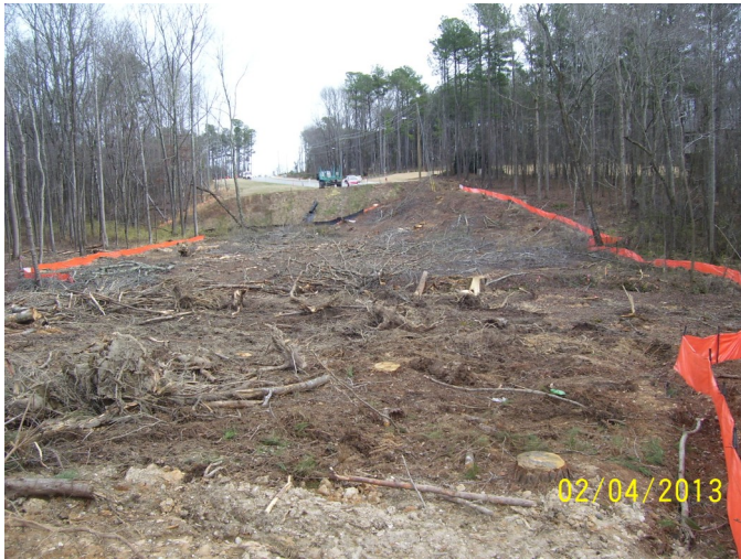
Location of permanent stream crossing has been cleared but not grubbed and/or stumped at this time. Perimeter silt fence is in place.