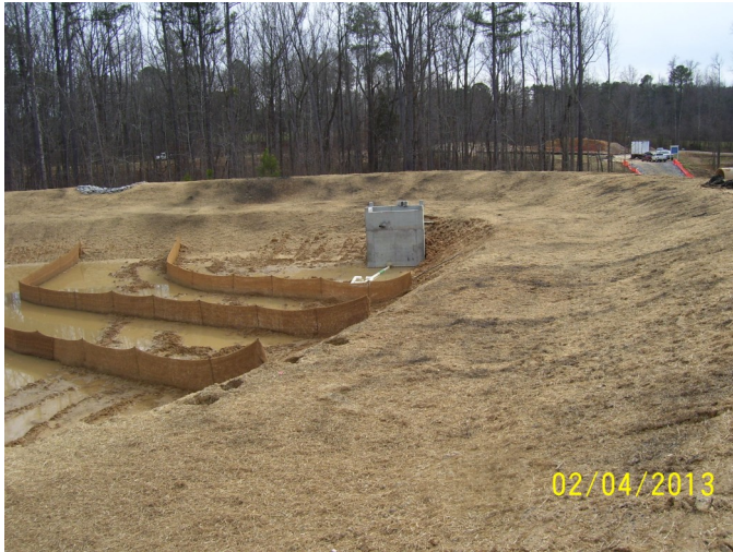
Basin "E" is complete with baffles and skimmer installed. The entire basin has been seeded, mulched and tacked.