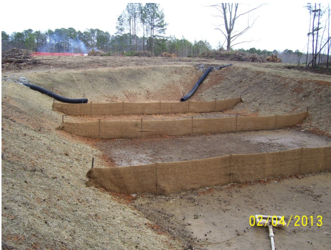
Temporary basin "B" is installed with slope drain, baffles and skimmer. Basin has been seeded and mulched.