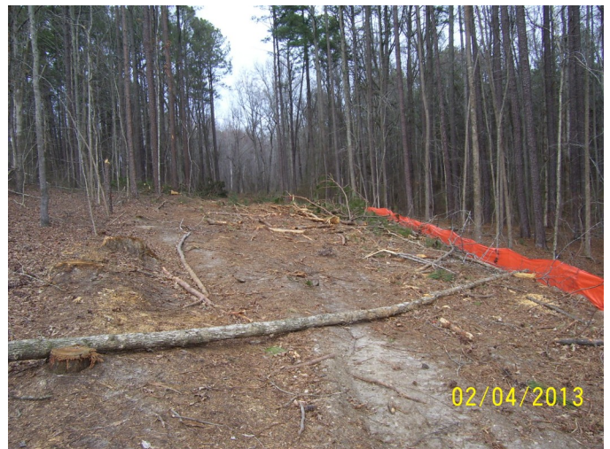
Location of sanitary sewer outfall has been cleared but not grubbed and/or stumped at this time. Perimeter silt fence is in place.