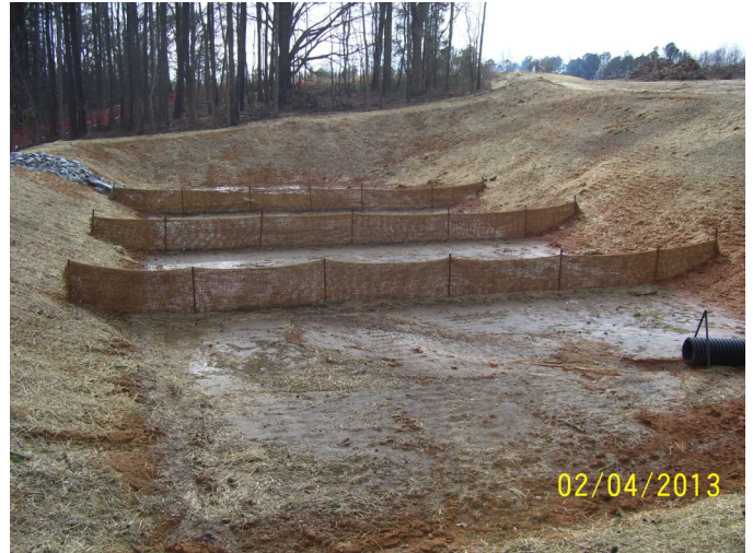
Temporary basin "A" is installed with slope drain, baffles and skimmer. Basin has been seeded and mulched.