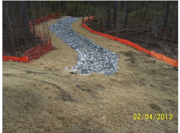
The outflow channel for basin "E" is complete with a rip rap lining and seed and mulch on either side to the silt fence.