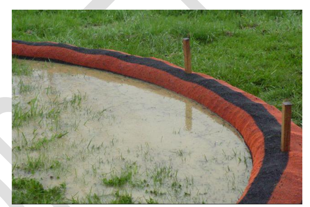
Figure 6.66a – Compost Sock

Compost products acceptable for this application should meet the chemical, physical and biological properties specified for Practice 6.18, Compost Blankets .