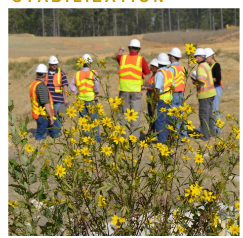
Stabilized: NCDOT addresses phases of construction to be sure areas do not exceed NCGO1 stabilization requirements.

The Department continues to evaluate products and techniques that will help stabilize erodible slopes that will be disturbed at a later date. Reduction in soil loss from these areas will aid in reducing turbidity levels at Stormwater Discharge outlets located throughout construction projects.