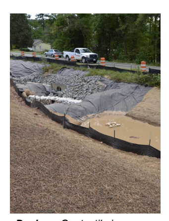
Design: Geotextile is sometimes used to prevent erosion in transitional phases of construction.

Overall, the Design effort continues to minimize impacts and find the balance between erosion control and sediment capture.