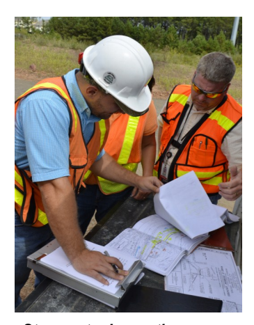
Stormwater Inspections: Inspectors continue to monitor correct NPDES reporting.

The Department has increased training and monitoring of NPDES reporting to verify project documentation is compliant with NPDES reporting regulations. Failure to comply with NPDES regulations results in the issuance of a Permit Consultation Needed (PCN), which results in corrective actions.