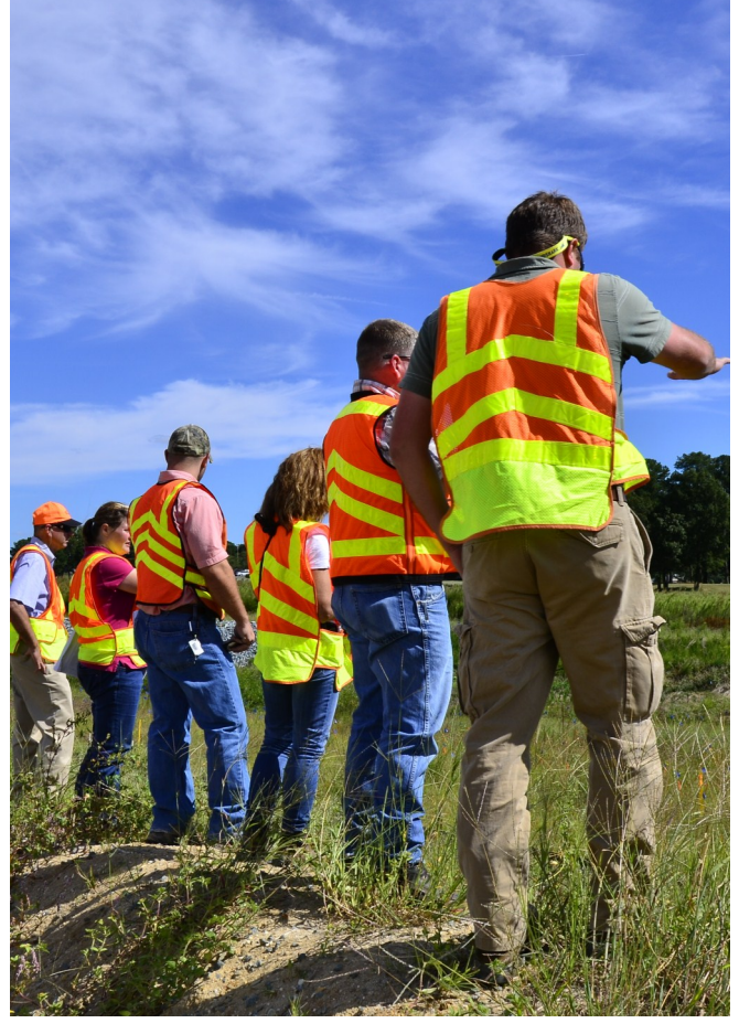
Review: NCDOT Staff addressing Land Quality questions during Annual reviews

The attached annual report outlines and highlights the work implemented and accomplished in 2013. It is important to note that this is an overview of the NCDOT Erosion and Sedimentation Control Program and provides a summarization of the programs overall content.