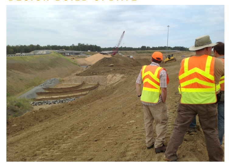
Design Review: Land Quality returned to the I-85/I-485 Design Build project to evaluate progress in revised Design Build procedures