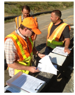
Teamwork : NCDOT relies on a series of inspectors and engineers to ensure compliance with the Delegated Agreement.

NCDOT relies on a combined effort to review and inspect projects to ensure compliance with the Sedimentation Pollution Control Act of 1973.