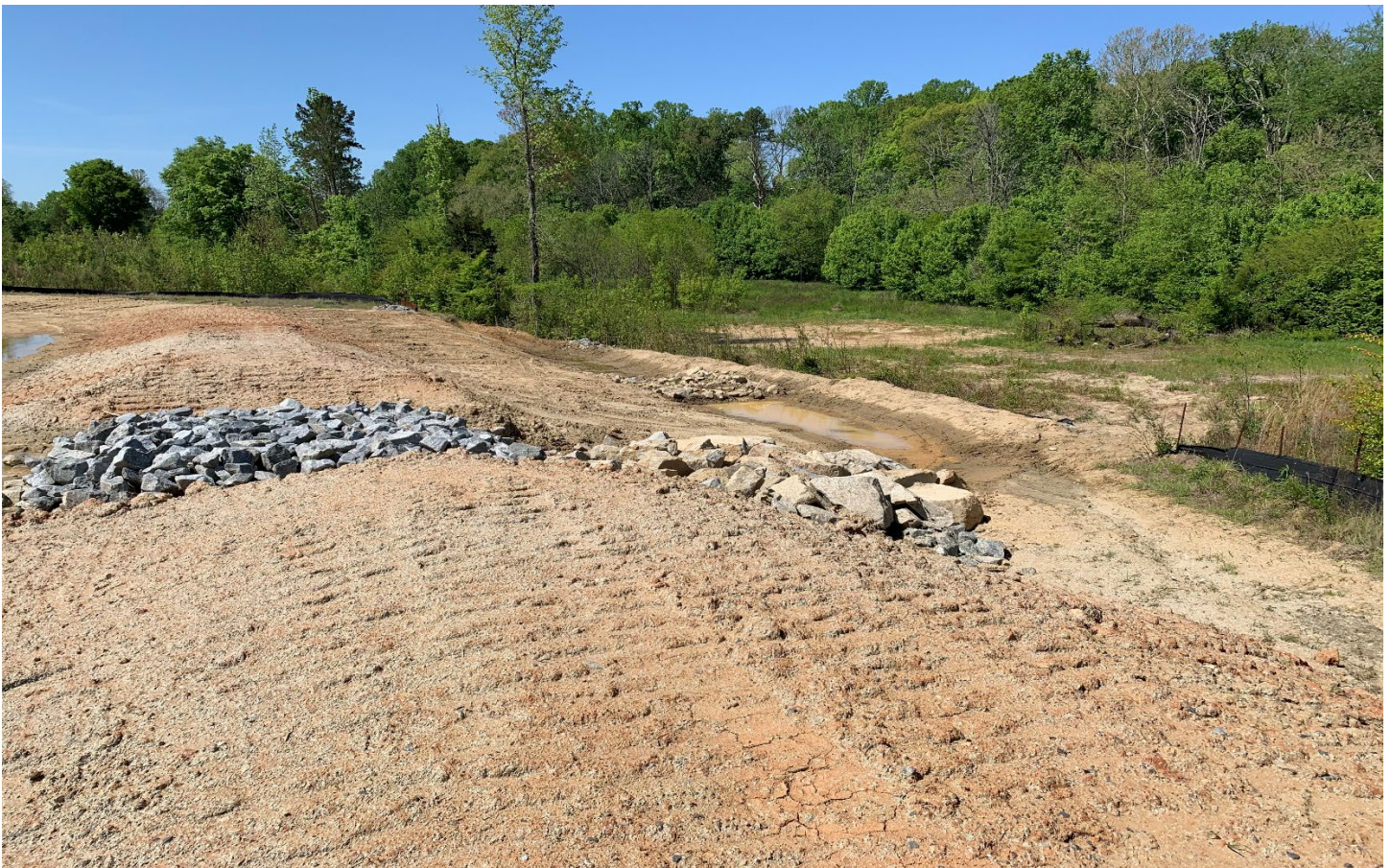
Picture #7: 04/27/2021 Sediment depositing into floodplain and wetland outside LOD.