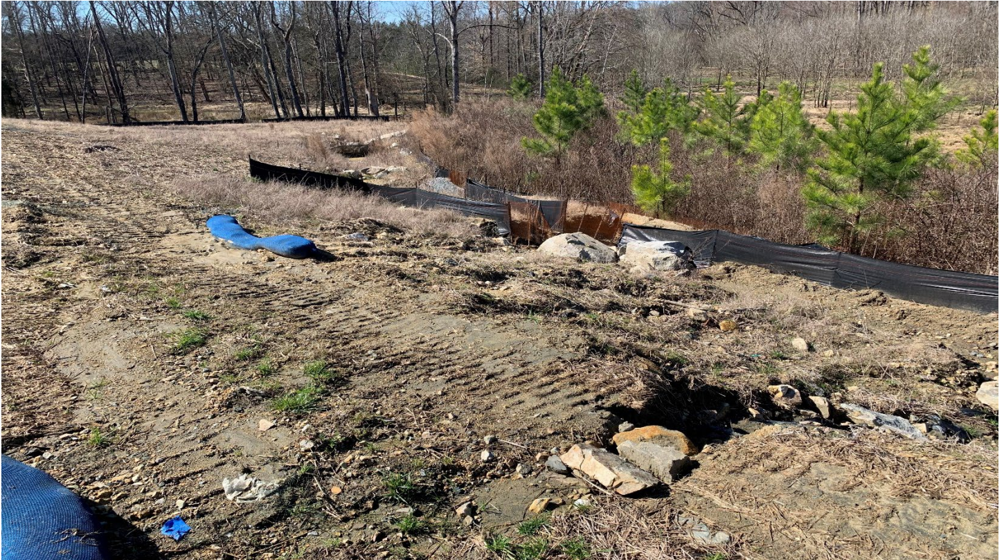
Picture #4: 03/03/2021 Silt Fence Rock outlet damaged and undermined. Large rills on slope and poor vegetation.