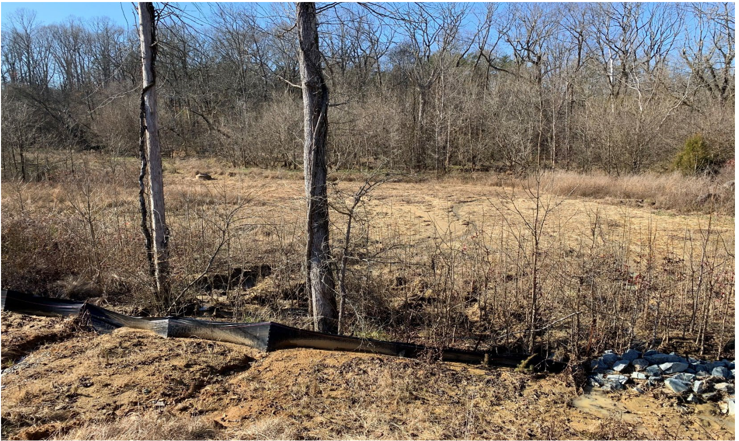
Picture #6: 01/12/2021 Sediment undermining silt fence and depositing in floodplain and wetland outside LOD.