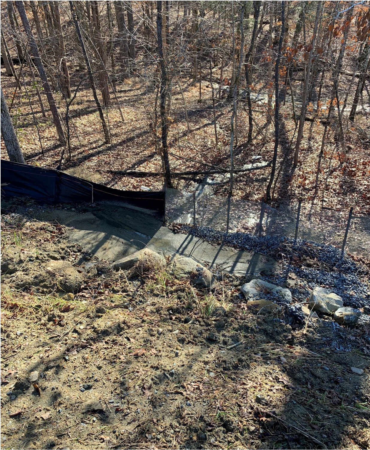
Picture #5: 01/12/2021, Sediment depositing outside the limits of disturbance (LOD) toward unnamed tributary.