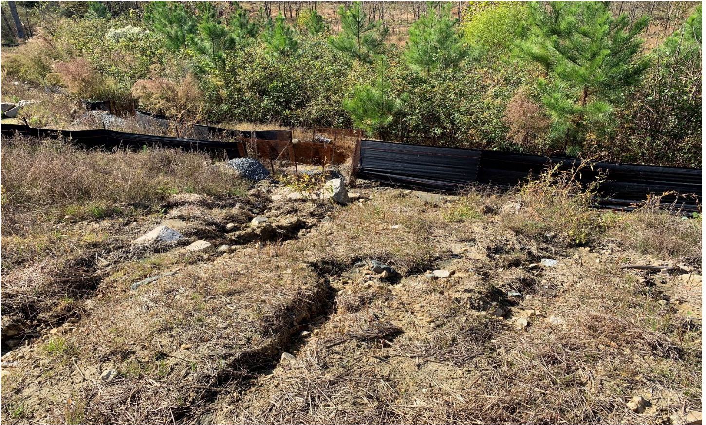
Picture #3: 11/05/2020 Silt fence and rock outlet damage, rills on slope, poor vegetation. Silt fence not trenched in per standard.