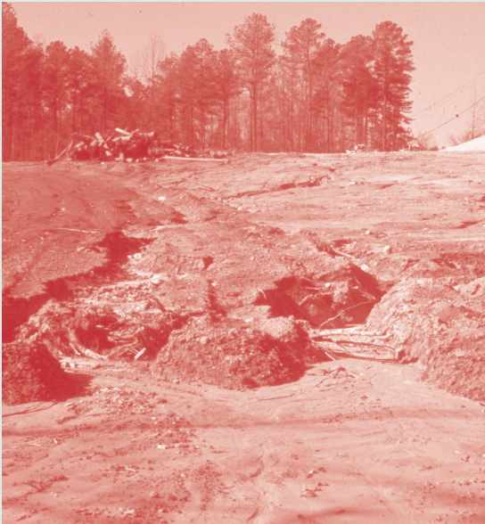
Erosion from unprotected construction sites harm our rivers, lakes, and streams.

The answer - sediment caused by soil erosion