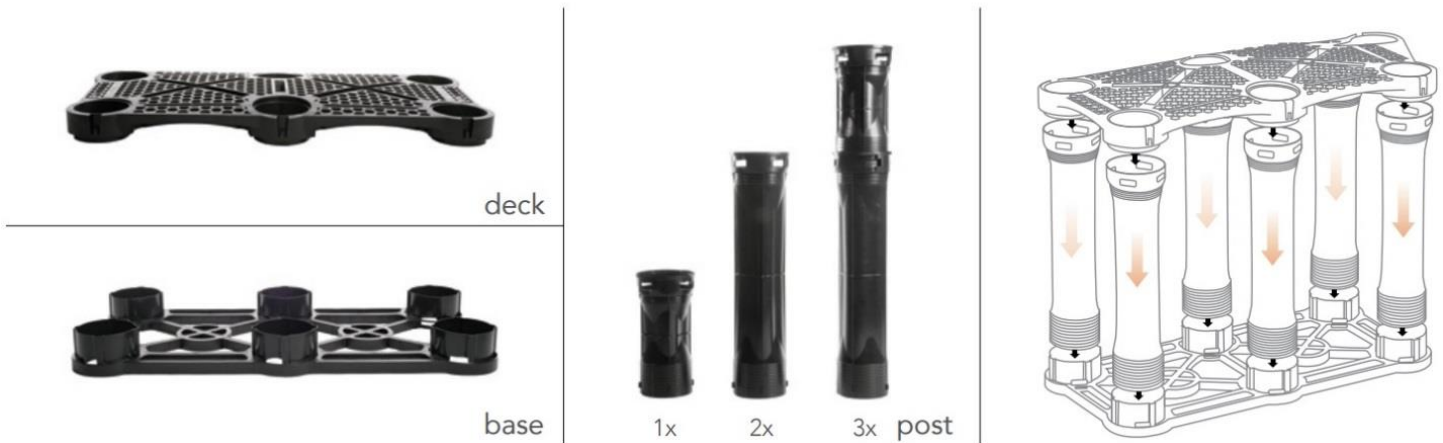
Figure 2: Silva Cell 2 (Left: 1x, Middle: 2x and Right: 3x)

H Height: 16.7" (424 mm) W Width: 24" (600 mm) L Length: 48" (1200 mm)