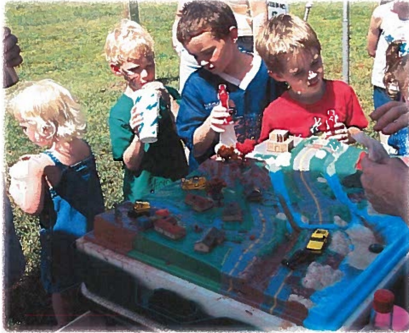
EnviroScape® model used for presentations

EnviroScape® is a series of interactive, portable models that dramatically demonstrate water pollution – and its prevention. EnviroScape® programs communicate to people of all ages that we share responsibilities in preventing water pollution.