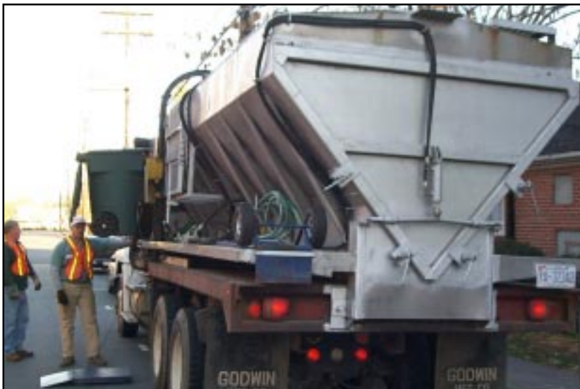
Dean Brooks' uniquely designed Freightliner flatbed dump truck collects food wastes from restaurants in Chapel Hill.