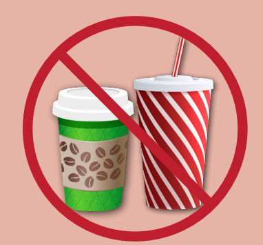
To-go hot and cold drink cups