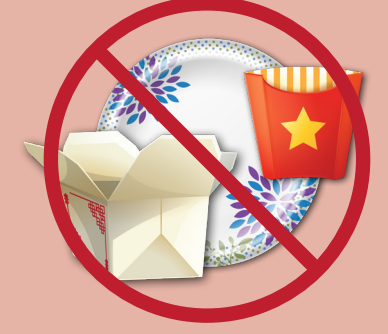
Plastic-coated (shiny) take-out boxes and plates