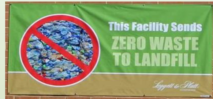
Tons of Landfilled Material