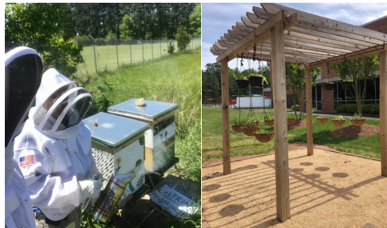
ESI Environmental Steward, Pfizer in Sanford, maintains beehives and an herb garden managed by their green team for use in their company café.