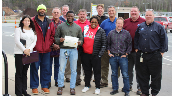
Mecklenburg County Solid Waste, an ESI Rising Steward, hosted ESI members for a training on internal auditing of environmental management systems.