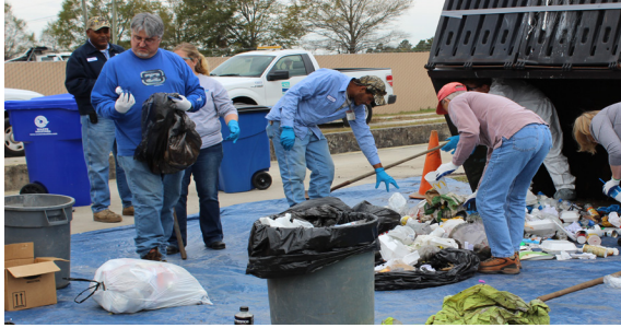
ESI Partner, Cape Fear Public Utility Authority, conducted a waste sort to educate employees on recyclable items that can be diverted from landfill disposal.