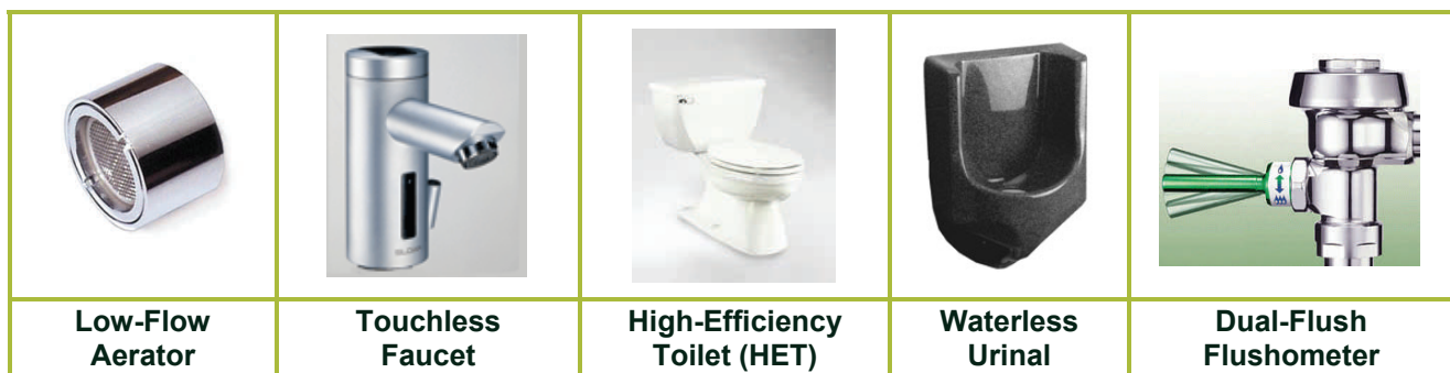
Table of Water Savings Options

Water-efficiency measures can lower your water and energy bills as well as improve operations. Low-cost and technological opportunities abound for using water efficiently in commercial bathrooms. Demonstrating your commitment to water efficiency will make a positive impression on your staff and the public. Some of the measures listed below can likely be applied to your business. The table below illustrates the associate water savings and cost benefits. We can all do our part to use water more effectively, thereby improving water quality and preserving our drinking water resources.