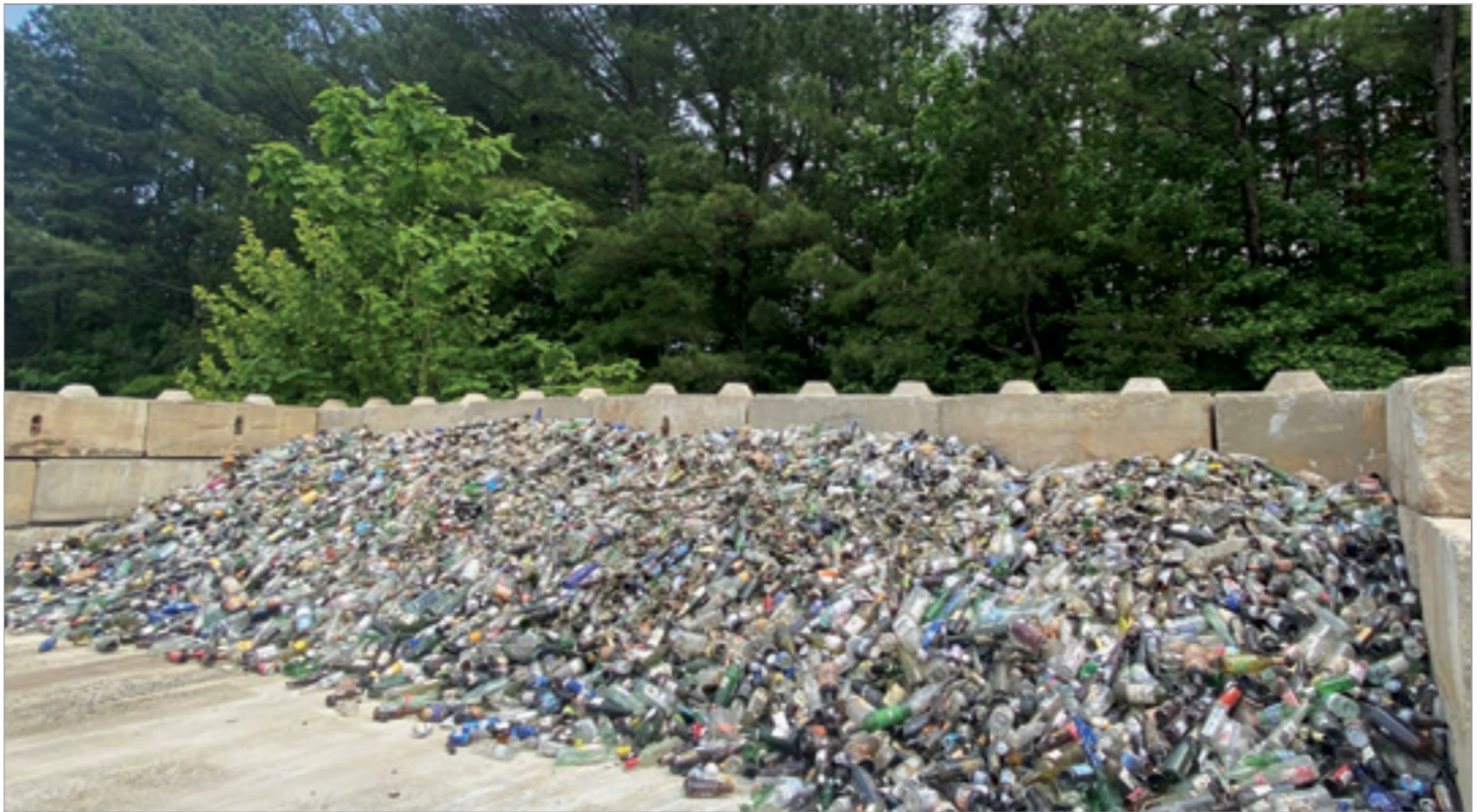
A glass aggregation bunker in Orange County, North Carolina. The county is at the center of a new hub-and-spoke collection network.