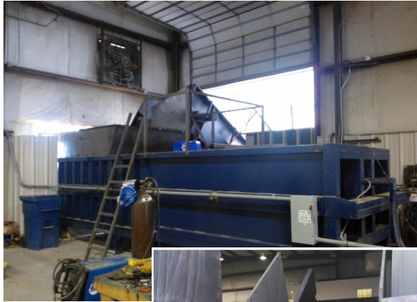
The conveyor and compactor shown here in GBUSA's spoke model were designed to fit into a compact area and have proven effective in consolidating commingled recyclables for transport to market.