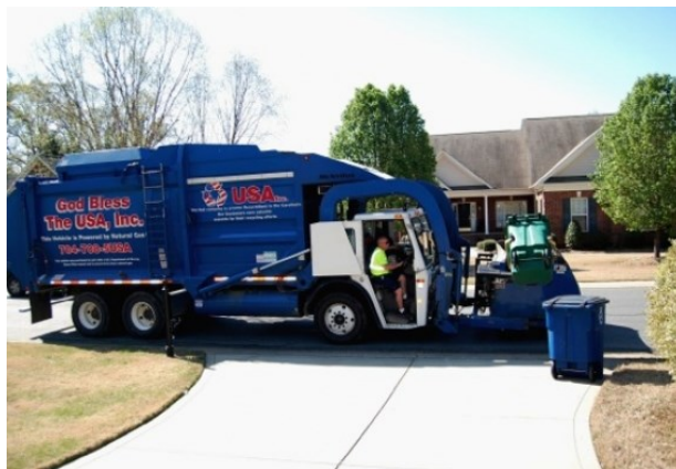
God Bless the USA, Inc. in Union County services more than 25,000 customers, including residential curbside customers, as shown above.

The map above illustrates the N.C. counties that have adopted hub-and spoke recycling programs in an effort to offer efficient, commingled recycling programs in rural areas.