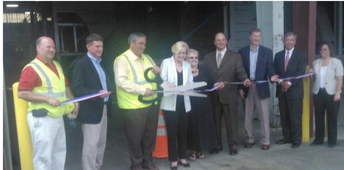
Local and state officials join Republic's management team for the ribbon cutting.