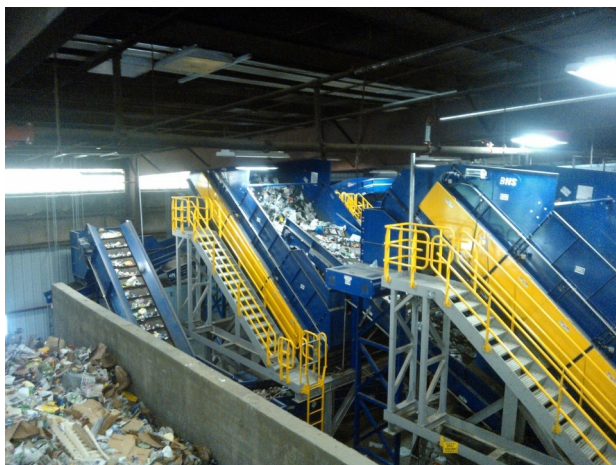
With the new high-tech equipment shown above, the new Conover facility has the ability to process 25 tons per hour with 98 percent sorting accuracy.

In addition, Republic invested in the facility's education center, which looks over the processing floor through a wall of windows. The education center includes a large screen moni-