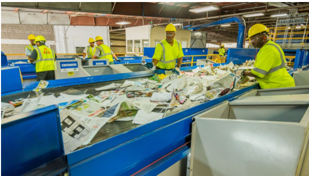
Republic's newest MRF in Conover employs 43 North Carolinians.