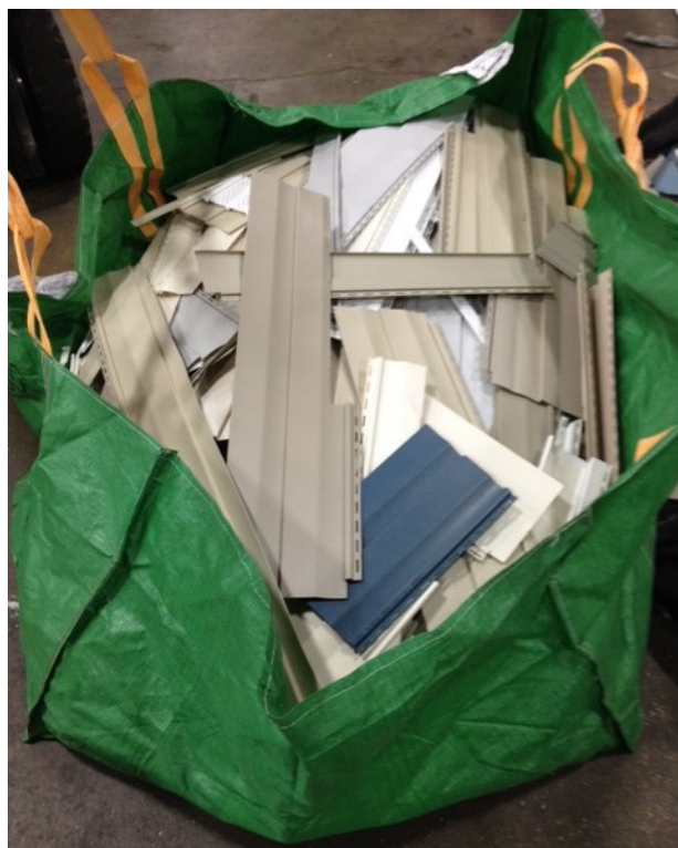
Dumpster bags (shown above) are filled with recovered vinyl siding by the generator and transported to Reily Recovery Systems for recycling.