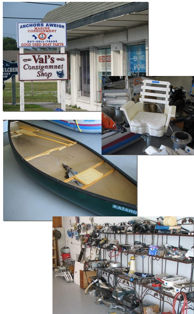
A wide variety of marine supplies, as shown above, can be found at the newly-opened Anchors Aweigh consignment shop, located in Beaufort, N.C.

For more information, contact Ed Carter or Penny Fleener at (252) 772-5088 or AnchorsAweighConsignment@ec.rr.com .