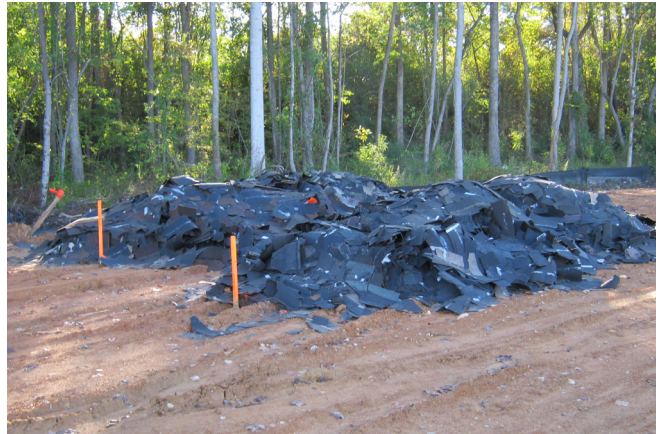
The first loads of clean asphalt shingles from Harnett County, seen here, await asbestos testing at Johnson Brothers Utility and Paving.

and Paving asphalt manager at (910) 893-8378 or jchj-bros@embarqmail.com .