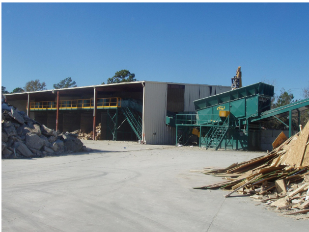
The Erin screening and sorting system pictured here is being installed at Griffin Brothers' Highway 49 facility near Harrisburg.