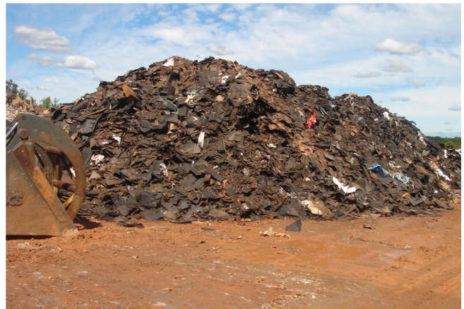
Segregated asphalt shingles await loading for delivery to Boggs Paving's asphalt shingle recycling operation.