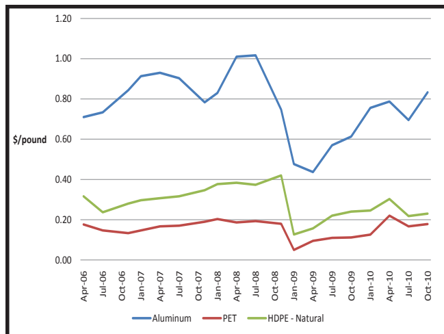
Quarterly prices for aluminum cans (loose), PET (baled) and HDPE natural (baled) in dollars per pound.