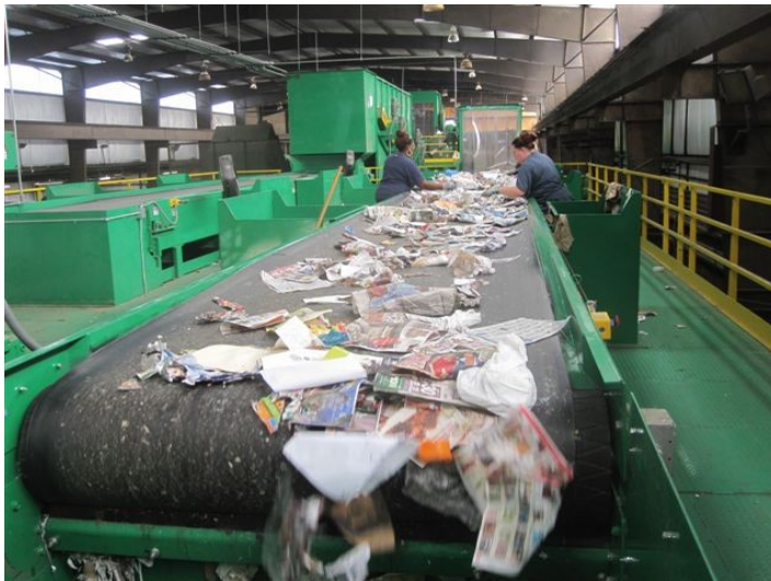
Two of North Davidson Garbage Service's employees sort recyclables at the company's new material recovery facility in Lexington.