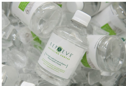
PET plastic bottles, like those shown here, are used to make the REPREVE fiber that will be used in new Ford Focus Electric.

For more information about Unifi visit www.unifi.com , or to learn more about REPREVE visit www.repreve.com .