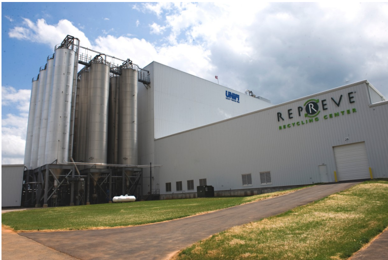
The $8 million REPVEVE Recycling Center investment will allow the company to significantly expand production capacities of its REPVEVE recycled fiber.