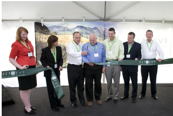
Unifi and federal government officials, along with the editor and publisher of EcoTextile News, cut the ribbon at the grand opening in May 2011.