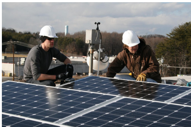
Workers perform final inspection of solar panels installed by SolarDyne at Plastic Revolutions.

Not only is Plastic Revolutions increasing production capacity, they are reducing operational costs at the same time. Thanks to an American Reinvestment and Recovery Act energy grant, the company replaced the fluorescent lighting at the facility with energy efficient lighting and replaced 13 old furnaces with two new high-efficiency furnaces. Fifty kilowatts of solar was added on the roof, enabling the company to sell power directly back to Duke Energy.