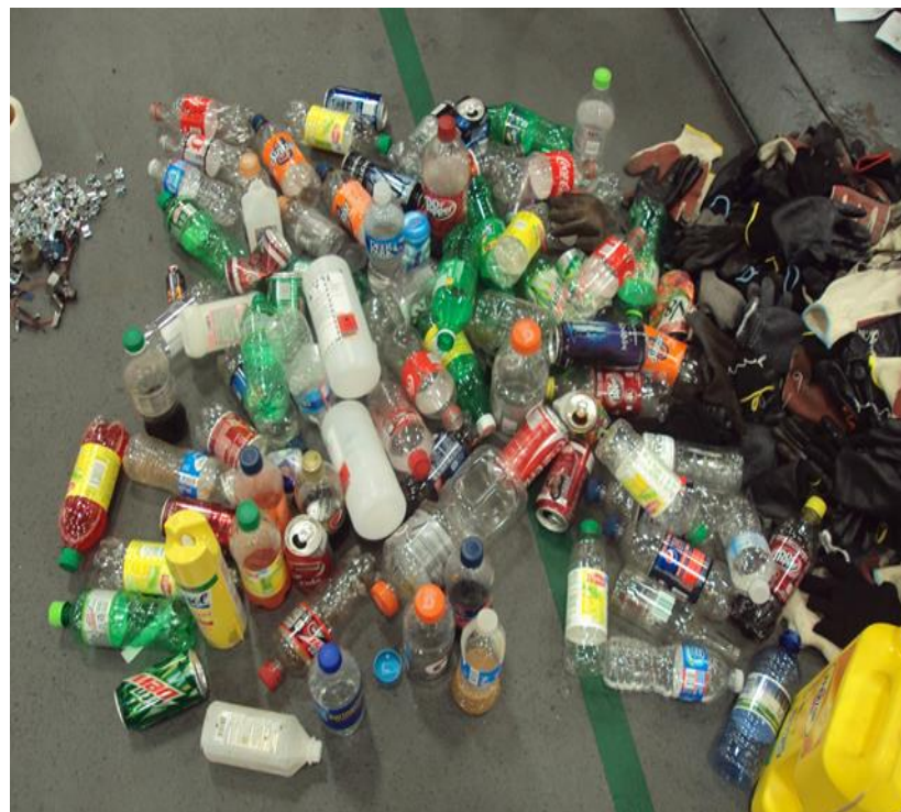
Beverage Containers - Illegal in North Carolina