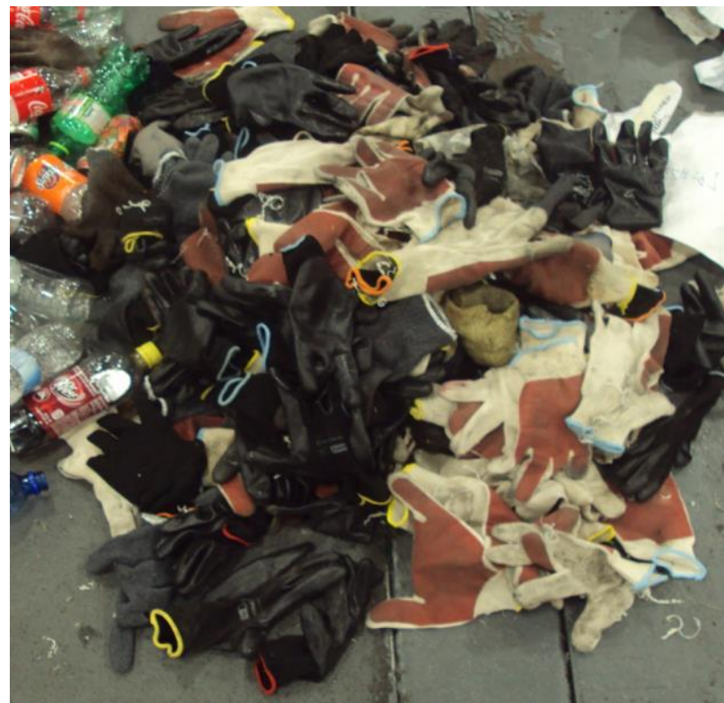
Gloves (we had a rewash program)