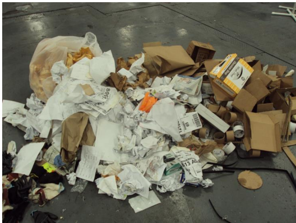
Paper and Cardboard