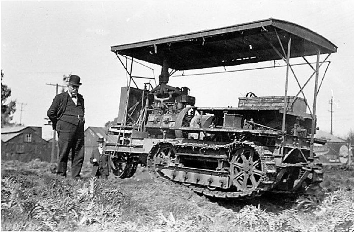
1906-Benjamin Holt with an early gas track-type tractor.

High level down, and outside in. Follow your products. Ask for help. Connect with suppliers.