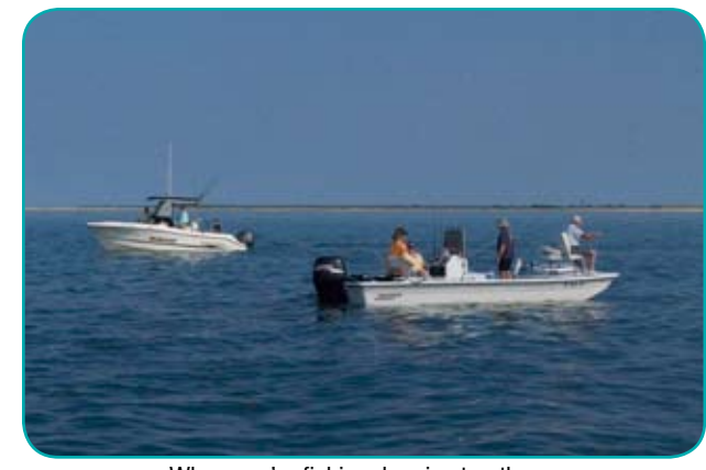
When you're fishing, be nice to others.