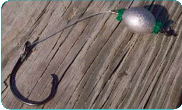
Example of a circle hook rig