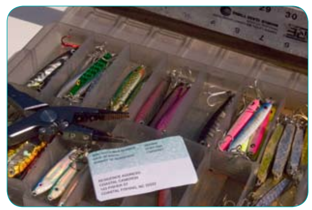
Tackle box essentials: tape measure, dehooking tool, glove or towel