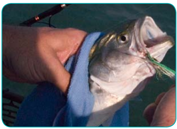
Use a soft, wet towel to hold the fish. This protects the fish and protects your hand from the sharp dorsal fin