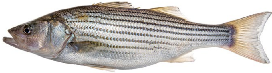
Estuarine Striped Bass