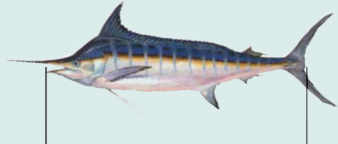
Lower Jaw Fork Length