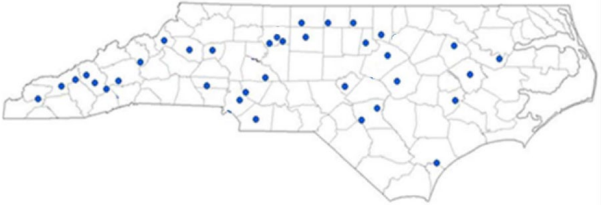
Figure 6.1 Ozone Monitoring Network (includes local program and tribal monitors)

The DAQ establishes ozone ambient air quality monitoring stations to: